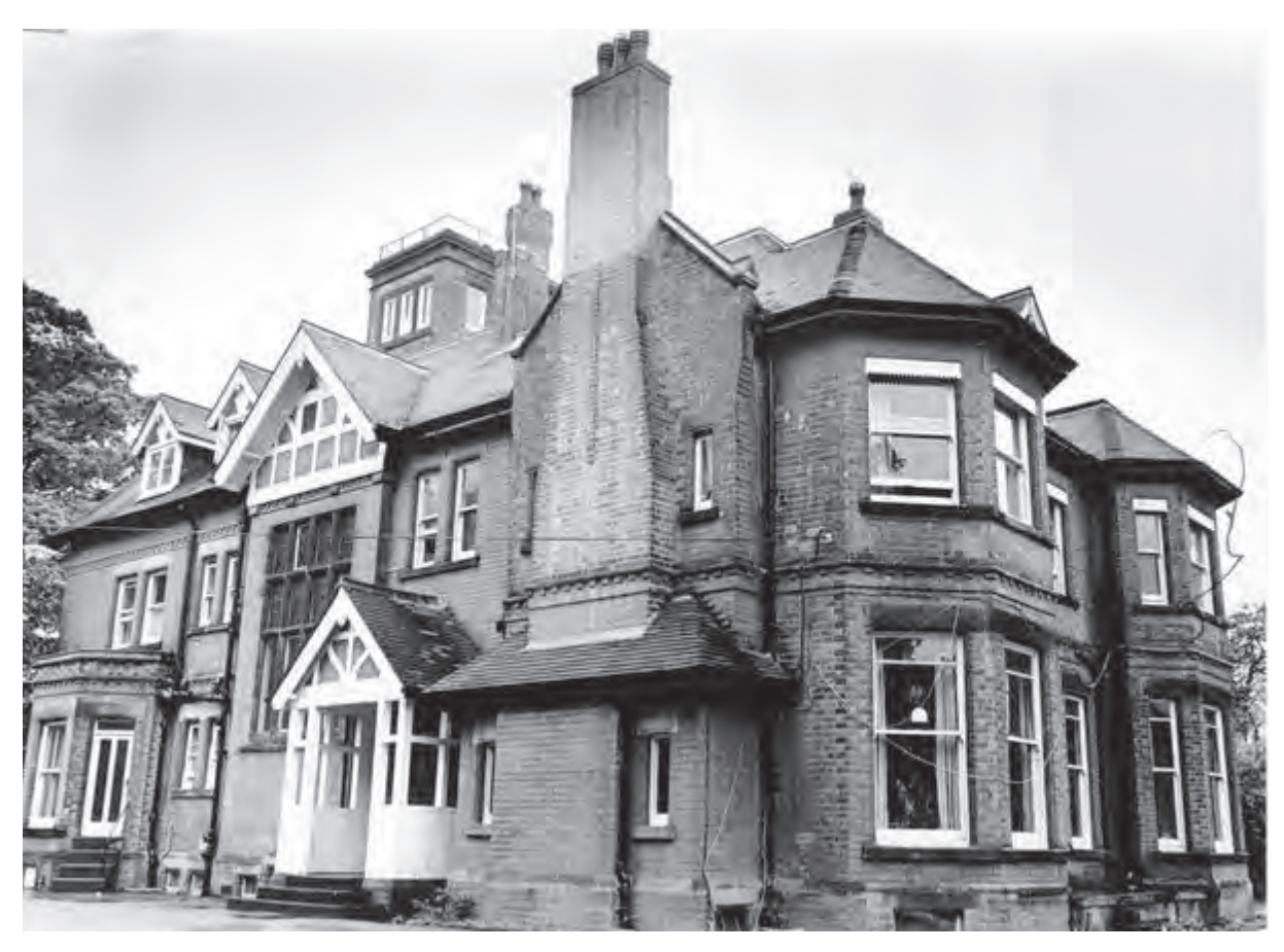
Beechwood Children's Home, mid-1980s