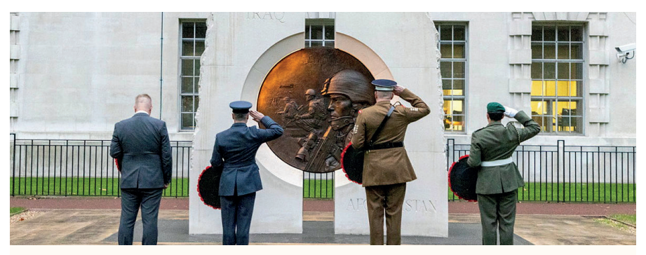
Representatives from the services and veterans' organisations saluting before laying wreaths at the Iraq and Afghanistan Memorial, Victoria Embankment Gardens, London, on 7th October 2021.