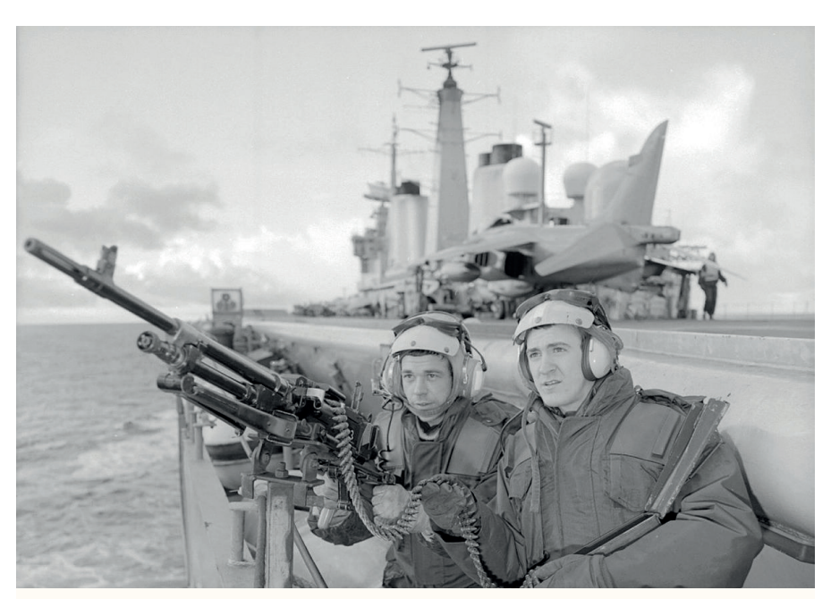
14th June 2022 marked the 40th anniversary of the ending of The Falklands War. Pictured: HMS Invincible's gun crew.