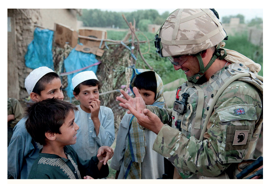
A soldier from the Queen's Royal Lancers, 2nd Troop jokes with local children, whilst operating in the area of Patrol Base Bolan, Afghanistan, in June 2010.