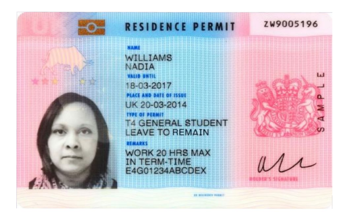
Figure 1 shows an example of a BRP: