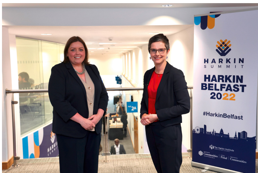
The Minister for Disabled People, Chloe Smith MP and the Minister for Communities of Northern Ireland, Deirdre Hargey MLA at the Harkin International Disability Employment Summit in Belfast

Chloe Smith MP, the Minister for Disabled People, attended the Harkin International Disability Employment Summit in Belfast, where she met with Communities Minister, Deirdre Hargey MLA, to discuss and share best practice on employment support for disabled people.