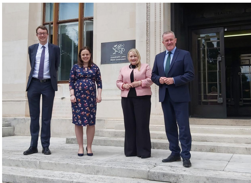
Chief Secretary to the Treasury, Right Honourable Simon Clarke MP, Scottish Government Cabinet Secretary for Finance and the Economy Kate Forbes MSP, Welsh Government Minister for Finance and Local Government Rebecca Evans MS, and Northern Ireland Executive Minister of Finance Conor Murphy MLA. Pictured after the Finance Interministerial Standing Committee meeting held in Cardiff.

The second meeting of the Finance: Interministerial Standing Committee was held on 15 June in Cardiff. This was the first meeting chaired by the Welsh Government as part of new intergovernmental relations rotational arrangements. It was chaired by Rebecca Evans MS, Welsh Government Minister for Finance and Local Government, and attended in person by the Chief Secretary to the Treasury, Right Honourable Simon Clarke MP, Northern Ireland Executive Minister of Finance, Conor Murphy MLA, and Scottish Government Cabinet Secretary for Finance and the Economy, Kate Forbes MSP.