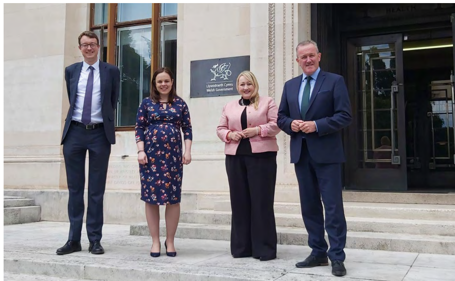
Chief Secretary to the Treasury, Rt Hon Simon Clarke MP, Scottish Government Cabinet Secretary for Finance and the Economy Kate Forbes MSP, Welsh Government Minister for Finance and Local Government Rebecca Evans MS, and Northern Ireland Executive Minister of Finance Conor Murphy MLA. Pictured after the Finance Interministerial Standing Committee meeting held in Cardiff.

It was chaired by Rebecca Evans MS, Welsh Government Minister for Finance and Local Government, and attended in person by the Chief Secretary to the Treasury, Rt Hon Simon Clarke MP, Northern Ireland Executive Minister of Finance, Conor Murphy MLA, and Scottish Government Cabinet Secretary for Finance and the Economy, Kate Forbes MSP.