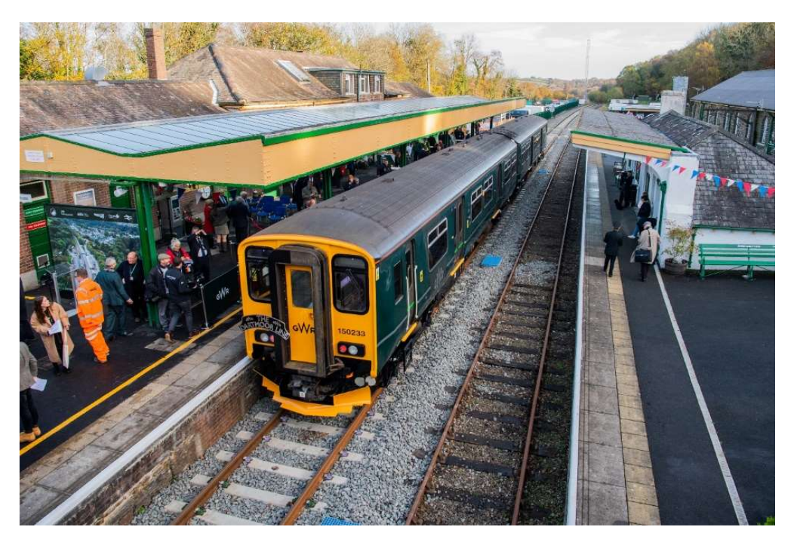
Regular passenger services return to Okehampton Station, November 2021

https://www.gov.uk/government/collections/restoring-your-railway-fund