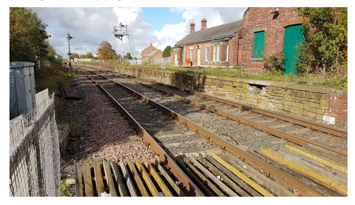
Bedlington Station in its current state, one of the six stations proposed to be reopened along the Northumberland line between Newcastle-upon-Tyne and Ashington

Business cases have also been submitted for the Borders Railway Extension and the Abertillery Rail Scheme. Work is ongoing between the Department for Transport and the Devolved Administrations to determine their suitability for inclusion in the Restoring Your Railway programme.