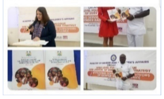
The UK provided technical support to the new Sierra Leone National Response Strategy for Survivors of Sexual and Gender-Based Violence

Today the Ministry of Gender and Children's Affairs launched the Sexual and Gender-Based Violence response strategy. @UkinSierraLeone is Proud to have supported this work to put survivor dignity, needs, and wants at the heart of response.