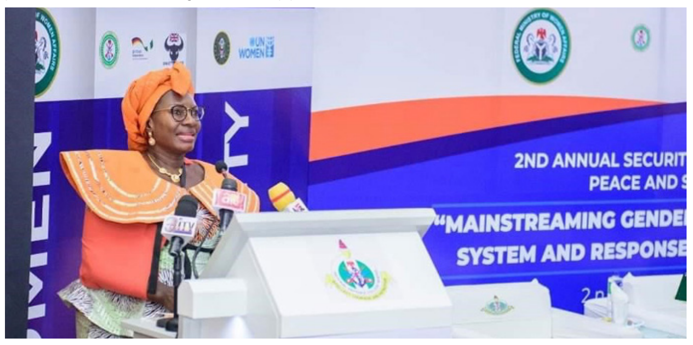
Nigeria Minister of Women's Affairs speaking at a WPS conference organised by the UK MOD in conjunction with the Ministry of Women Affairs and the Nigerian Uniformed Services

The UK strengthened military cooperation on WPS and human security themes, including integrating it into military training programmes; providing support to Gender Focal Points in the Nigerian single services and Defence HQ; and delivering specific training to military officers on gender awareness. The UK funded the training of Nigerian military personnel on the understanding, impact and prevention of SEA, reaching 1000 military personnel to date.