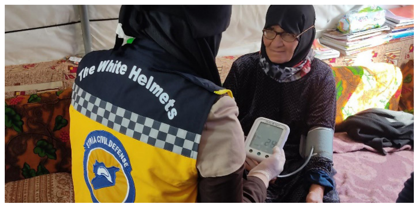
Syria Civil Defence volunteers provide essential and life-saving health services

women from the surrounding community and supporting other SCD teams as needed. The UK also supported SCD's efforts to institutionalise gender sensitivity and inclusion into internal management and operations.