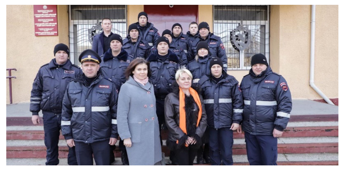
UNFPA provides support to the police in Ukraine to improve their GBV response

In Ukraine , the UNFPA EMBRACE project worked with the Government of Ukraine to change the policy and legislative landscape to support the prevention of GBV, to establish sustainable services for survivors, and to enable the effective prosecution of those perpetrating GBV. In doing so it has helped to establish 16 shelters, five crisis rooms, and ten centres for GBV survivors across the country.