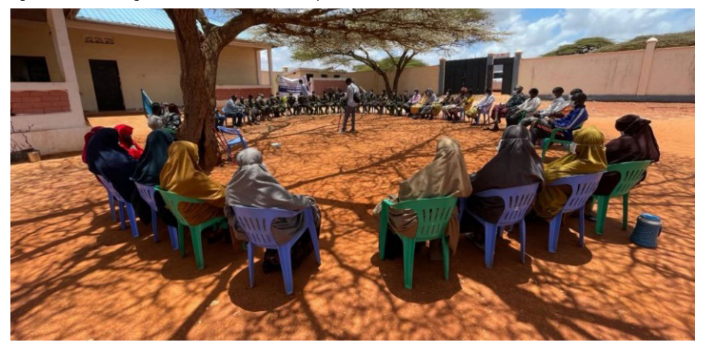
Jubaland Security Forces engage with local communities through the Early Recovery Initiative

men and children in the justice system. Female prosecutors were specifically included in training of Somaliland's justice sector, with gaps (and opportunities) identified to focus further on women's rights as human rights and enable access to justice.