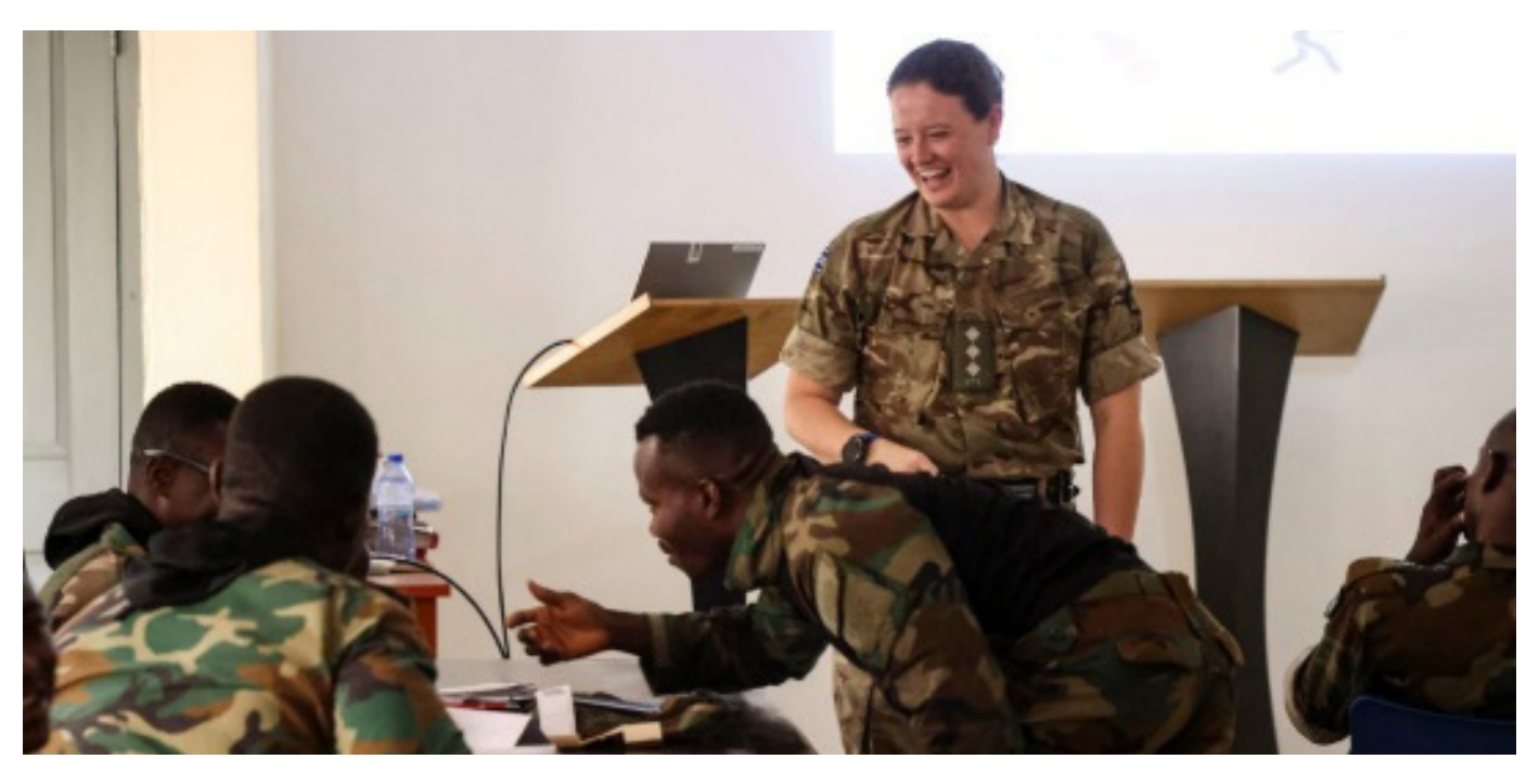
UK MOD provides WPS training to the Ghanian Army Special Operations Brigade

In Ghana , the UK through the MOD provided foundation-level Human Security Training to the Ghanian Army Special Operations Brigade focused on WPS and P/CVE, with the aim of mainstreaming gender across all programming, and strengthening capabilities, processes and leadership to deliver WPS commitments in all activities in conflict-affected contexts, including through developing the necessary resources, expertise and skills.