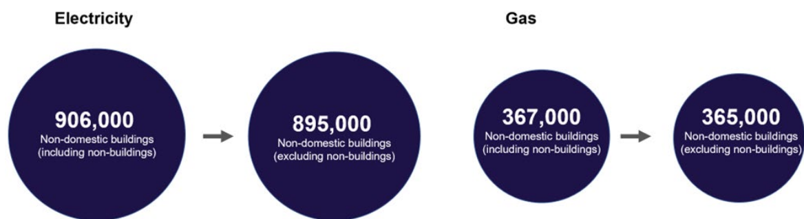
Figure 2: The removal of non-buildings from the ND-NEED electricity and gas consumption samples

The removal of non-buildings from the sample also removes the energy consumption associated with these non-buildings from the ND-NEED consumption figures (19 TWh for electricity and 16 TWh for gas in 2020).