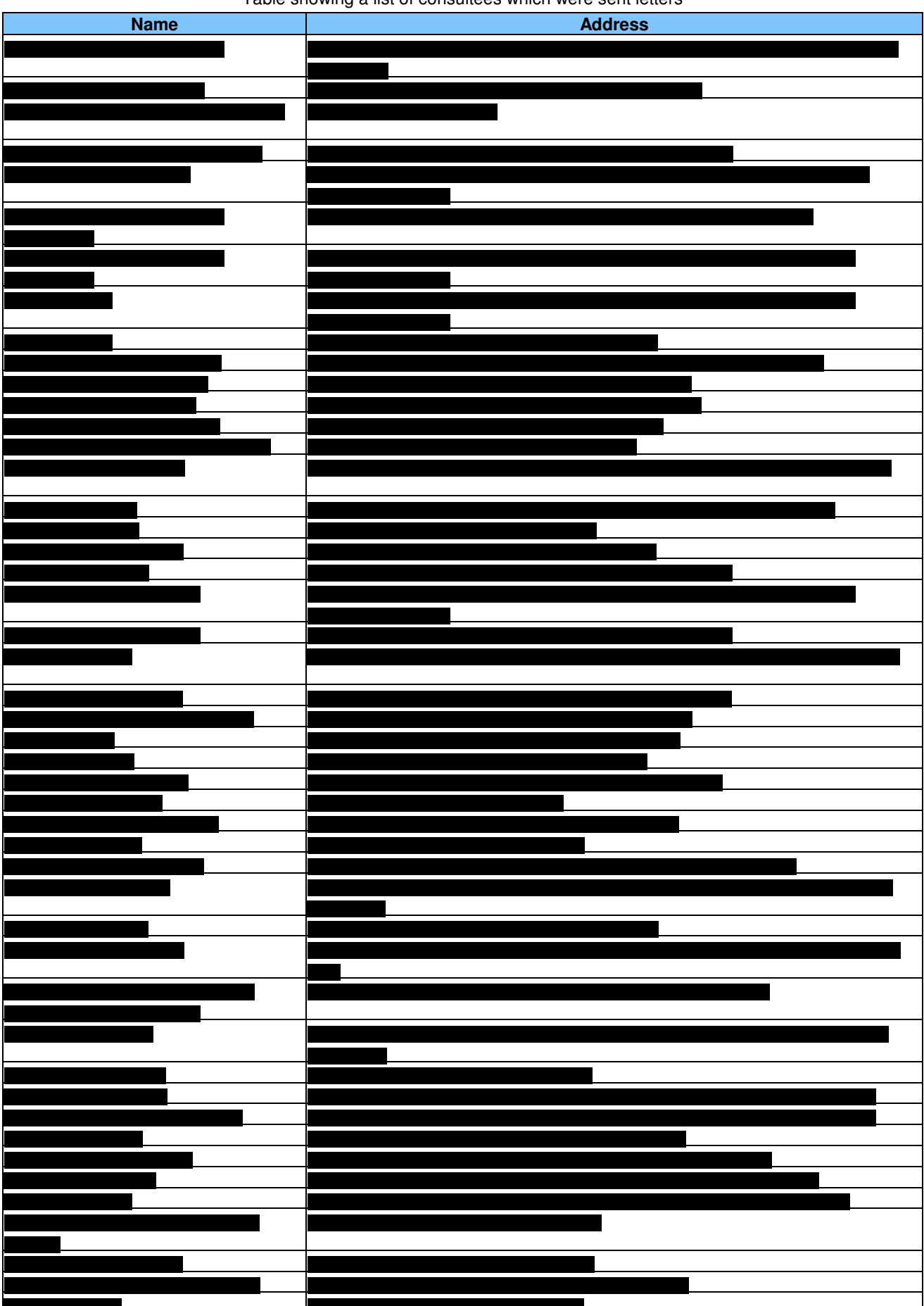
Table showing a list of consultees which were sent letters