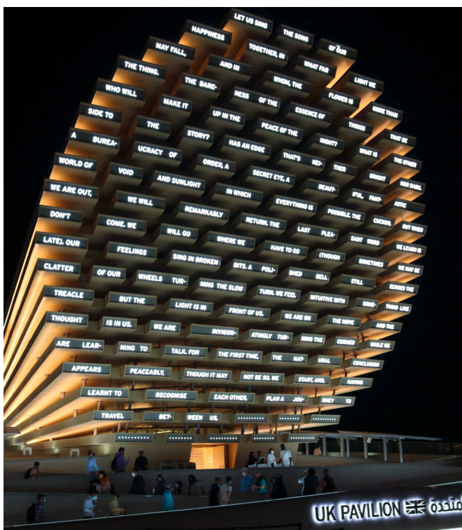
The UK Pavilion at Expo 2020 Dubai.

The Foreign, Commonwealth and Development Office has continued to work with the devolved governments both in the UK and overseas, and across a wide range of international facing issues. This has included visits made by devolved government ministers to Ireland and the postponed 2020 Dubai Expo, where civil servants worked together to facilitate and support these overseas visits.