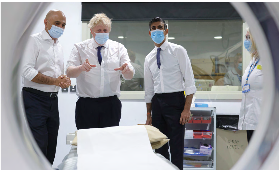
Secretary of State for Health and Social Care the Right Honourable Sajid Javid MP, Prime Minister the Right Honourable Boris Johnson MP, and Chancellor of the Exchequer the Right Honourable Rishi Sunak visit Queen Elizabeth II Hospital in Welwyn Garden City, Hertfordshire.

In March the Chief Secretary to the Treasury, the Right Honourable Simon Clarke MP, chaired the inaugural meeting of the Finance Interministerial Standing Committee, attended by the finance ministers from the devolved administrations, providing a new forum for discussion on finance matters. Ministers discussed a wide range of key issues, such as the Spring Statement and cost of living, end of year budgetary communications, levelling up, the UK Infrastructure bank and P&O Ferries. Alongside this, the UK Government and Scottish Government met twice to discuss the Shared Prosperity Fund and cross-UK investment opportunities.