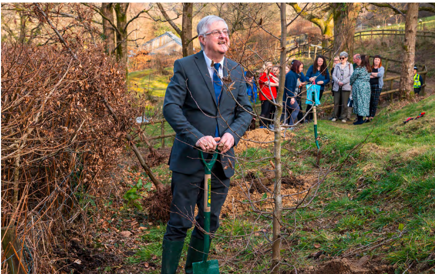
Welsh First Minister the Right Honourable Mark Drakeford MS at a COVID-19 memorial woodland in Caerphilly.

Although COVID-19 restrictions have reduced across the UK as our joint pandemic responses prove effective, engagement across the governments has nevertheless continued apace. The Secretary of State for Levelling Up, supported by the Secretaries of State for the Territorial Offices, continued to hold regular calls with the First Ministers of Scotland, Wales and Northern Ireland and deputy First Minister of Northern Ireland, to collaborate and coordinate responses to COVID-19. The Secretary of State for Health and Social Care met regularly with devolved government health ministers, discussing issues such as on the Joint Committee on Vaccination and Immunisation (JCVI) advice on COVID-19 vaccines, the National Testing Programme including testing resilience, capacity and, more recently, the future of testing policy, COVID-19 certification, antivirals and therapeutics. The Chief Medical Officers met on key programme boards within the UK Health Security Agency, as well as discussions led by Dr. Jenny Harries, to coordinate the respective test, trace, contain, and protect programmes.