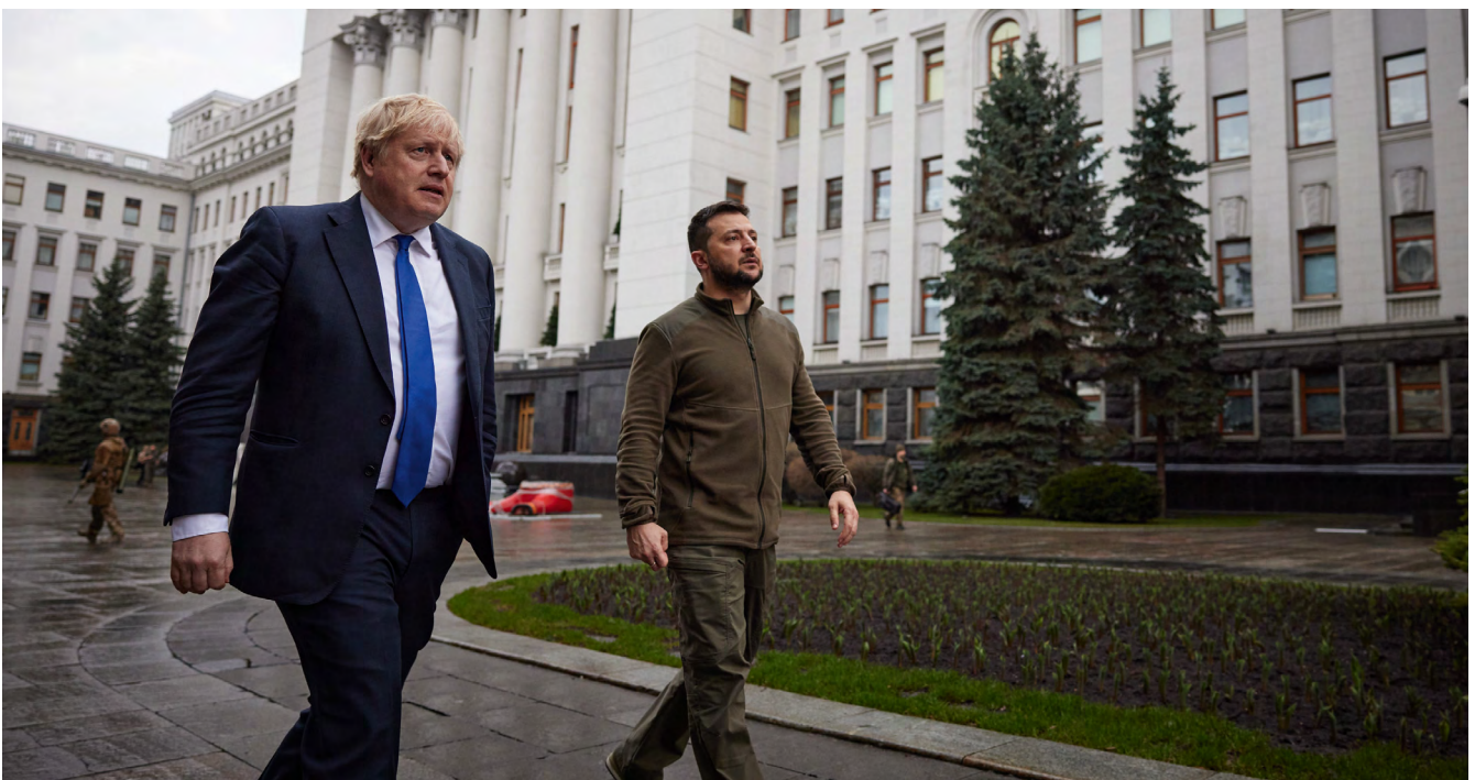
Prime Minister the Right Honourable Boris Johnson MP with the President of Ukraine Volodymyr Zelenskyy on a visit to Kyiv in April 2022.

The Paymaster General, the Right Honourable Michael Ellis QC MP, chaired six ministerial calls with the First Ministers of Scotland and Wales and Northern Ireland Executive civil servants, covering the domestic response to and impacts of the invasion. These meetings ensured a rapid and flexible response to the latest developments in Ukraine, with the Parliamentary Under Secretary of State at the Department for Transport, Robert Courts MP leading on the successful restriction of Russian vessels from Scottish ports. As the war in Ukraine continues, all four governments will carry on working together for the people in Ukraine.