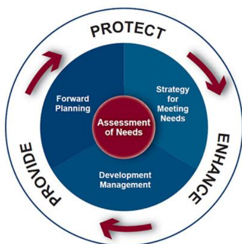
Figure 1: Planning for Sport model

As illustrated, the model involves an assessment of needs, which informs the strategy for meeting those needs. This strategy then informs the development management process, which leads to the provision of facilities. The provision of facilities is then monitored and enhanced, which in turn informs the protection of existing facilities.