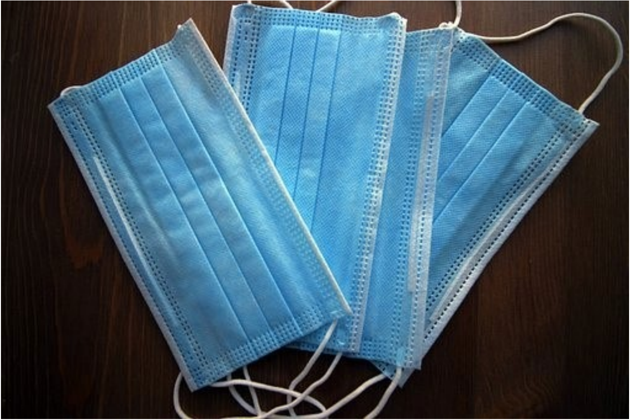
KN95 face mask