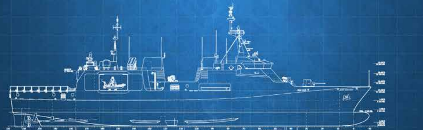
Class: ✦ 100A1 NS3 OFFSHORE PATROL VESSEL