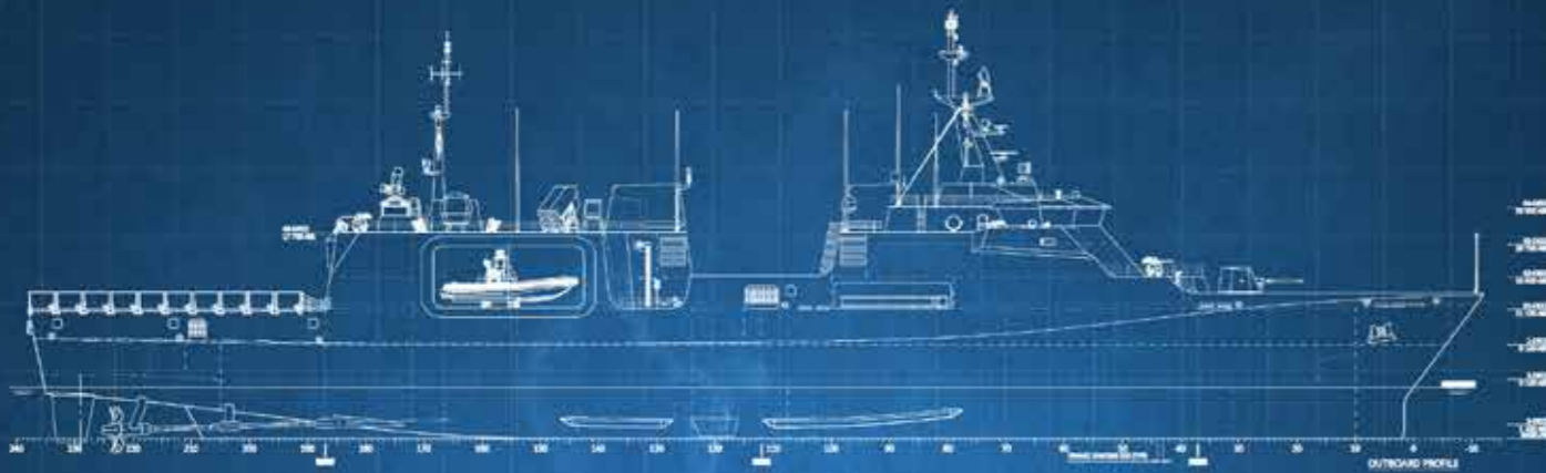
Class: ✦ 100A1 NS2 OFFSHORE PATROL VESSEL