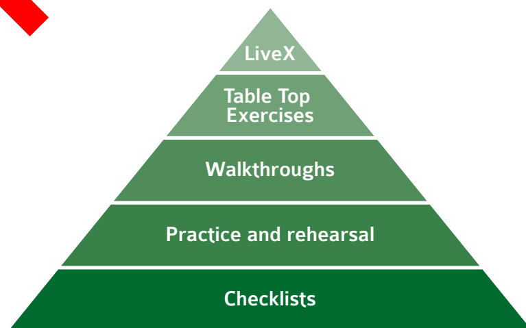
Figure 1: Multiple layers of Testing and Exercising

Figure 1 , below illustrates the multiple layers and the subsequent sections describe the activities and tasks that will be involved within each layer. The tasks described are intended to establish a site's readiness to respond to an MTA but will also cross over to other threat areas.