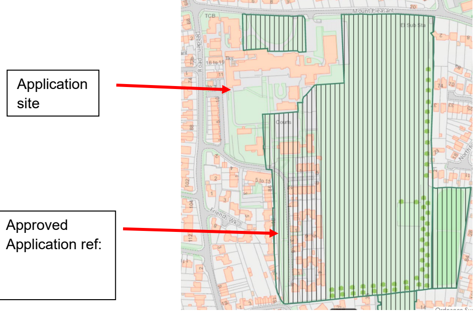
Figure 2: Protected public open space