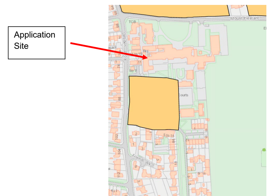
Figure 1: Extract of Local Plan showing site falls within an area of Archaeological Site of Interest.