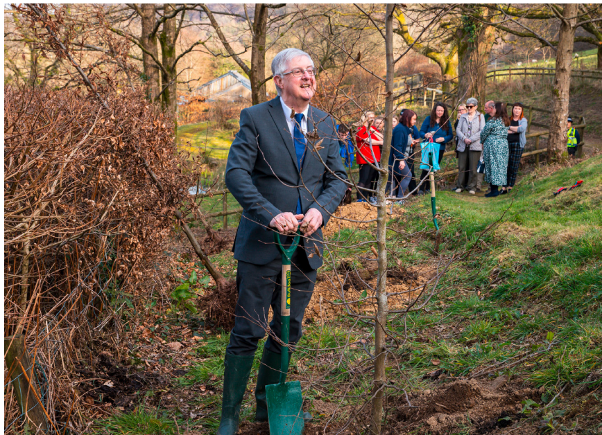
Welsh First Minister the Rt Hon Mark Drakeford MS at a COVID-19 memorial woodland in Caerphilly.

Although COVID-19 restrictions have reduced across the UK as our joint pandemic responses prove effective, engagement across the governments has nevertheless continued apace. The Secretary of State for Levelling Up, supported by the Secretaries of State for the Territorial Offices, continued to hold regular calls with the First Ministers of Scotland, Wales and Northern Ireland and deputy First Minister of Northern Ireland, to collaborate and coordinate responses to COVID-19. The Secretary of State for Health and Social Care met regularly with devolved government health ministers, discussing issues such as on the Joint Committee on Vaccination and Immunisation (JCVI) advice on COVID-19 vaccines, the National Testing Programme including testing resilience, capacity and, more recently, the future of