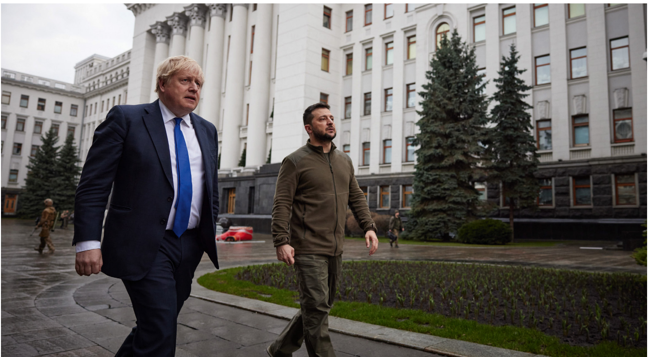
Prime Minister the Rt Hon Boris Johnson MP with the President of Ukraine Volodymyr Zelenskyy on a visit to Kyiv in April 2022.

The Paymaster General, the Rt Hon Michael Ellis QC MP, chaired six ministerial calls with the First Ministers of Scotland and Wales and Northern Ireland Executive civil servants, covering the domestic response to and impacts of the invasion. These meetings ensured a rapid and flexible response to the latest developments in Ukraine, with the Parliamentary Under Secretary of State at the Department for Transport, Robert Courts MP leading on the successful restriction of Russian vessels from Scottish ports. As the war in Ukraine continues, all four governments will carry on working together for the people in Ukraine.