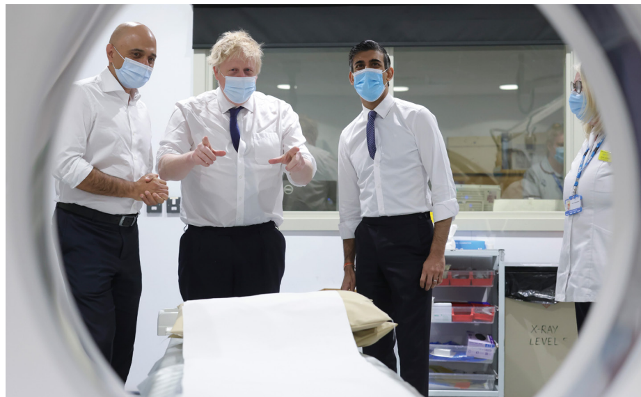
Secretary of State for Health and Social Care the Rt Hon Sajid Javid MP, Prime Minister the Rt Hon Boris Johnson MP, and Chancellor of the Exchequer the Rt Hon Rishi Sunak visit Queen Elizabeth II Hospital in Welwyn Garden City, Hertfordshire.