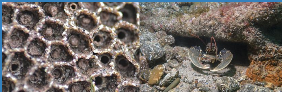
Ross worm and the structures they create (left) which are home to many more species including European lobster ( Homarus gammarus) which is a commercially important species for UK fisheries (right)

The site provides a source of food and shelter for many animals including fish, crabs, and mussels, as well commercially important species such as the European lobster, and pink shrimp. The site also acts as a breeding ground for commercially important fish species such as sand eels and Atlantic herring.