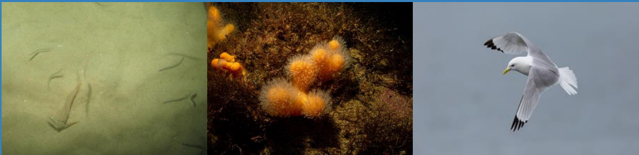
Sandbank and sandeels (left) dead man's fingers (centre) black-legged kittiwake (right)

The Dogger Bank sandbank was formed by glacial processes over thousands of years and formed part of a land bridge between Great Britain and mainland Europe before being submerged through sea-level rise. The sandbank provides habitats for a wide range of fish species such as cod, plaice, common skate and angel shark, as well as invertebrates including crabs, starfish, brittlestars and burrowing worms, which provide an important food source for larger animals. Soft corals known as 'dead man's fingers' are also found here, as well as long-lived species such as the ocean quahog, a type of clam which can live to over 500 years old. The site is an important location for sandeels, which are a vital food source for seabirds such as puffins and kittiwakes, as well marine mammals such as harbour porpoises and grey and common seals.