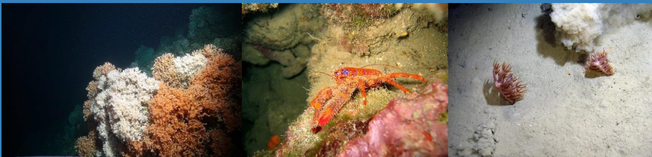
old-water corals (left) squat lobster (centre) sea-pens and burrowing megafauna (right)

The Canyons MCZ is home to the only known example of cold-water coral reefs and coral gardens in English waters, as well as biologically diverse communities of sea-pens and burrowing species such as anemones and squat lobsters. Cold-water corals can live for thousands of years and are extremely slow growing, at a rate of about 6 mm a year. This slow growth, combined with their brittle skeletons, means the coral reefs are particularly sensitive to damage from certain types of fishing. The coral reefs add three-dimensional complexity to deep water environments, providing other species with shelter from predators, as well as feeding, spawning and nursery grounds that may enhance the survival of commercially important fish such as mackerel.