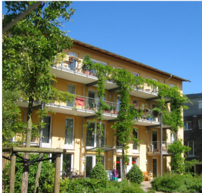
Greening of buildings – important in creating sustainable developments Vauban, Freiburg, German