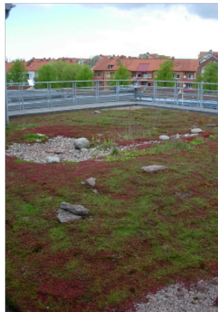
Examples of living roofs