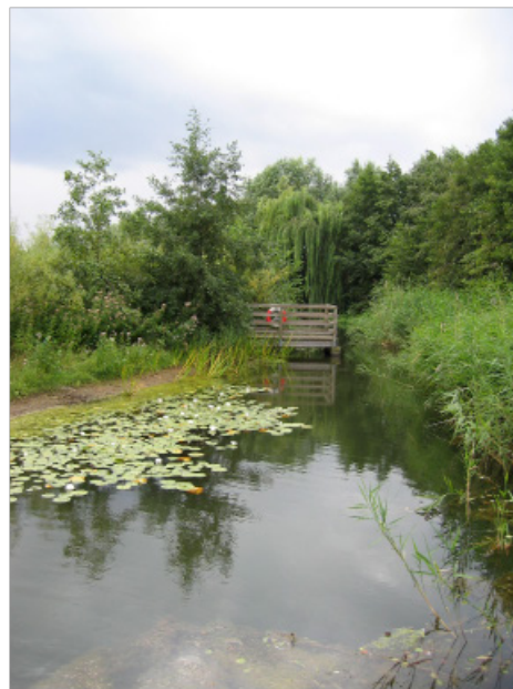
Ecology Park, Millenium Village, London