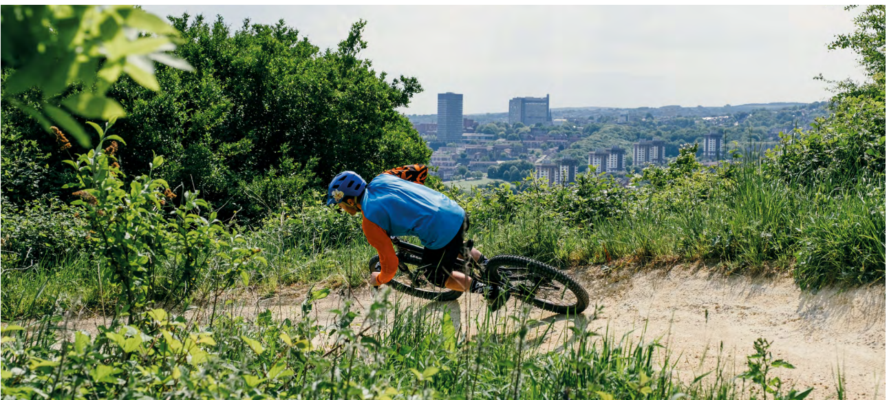
BMX biker at Parkwood Springs Mountain Bike Trail, Sheffield

The Mayoral Combined Authority’s Chief Finance Officer (also known as the ‘Section 73 Officer’) must make sure that the Mayoral Combined Authority manages taxpayers’ money properly and secures good value for money. The Mayoral Combined Authority’s Audit and Scrutiny Committee arrangements also have an important role in monitoring how it manages its finances.