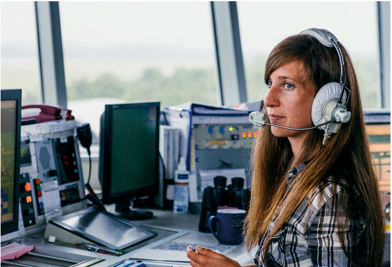
Air Traffic Controller at Doncaster Sheffield Airport, Doncaster

Our vision is to grow an economy that works for everyone. We will develop inclusive and sustainable approaches that build on our innovation strengths and embraces the UK's fourth industrial revolution, to contribute more to the country's prosperity and enhance quality of life for all.