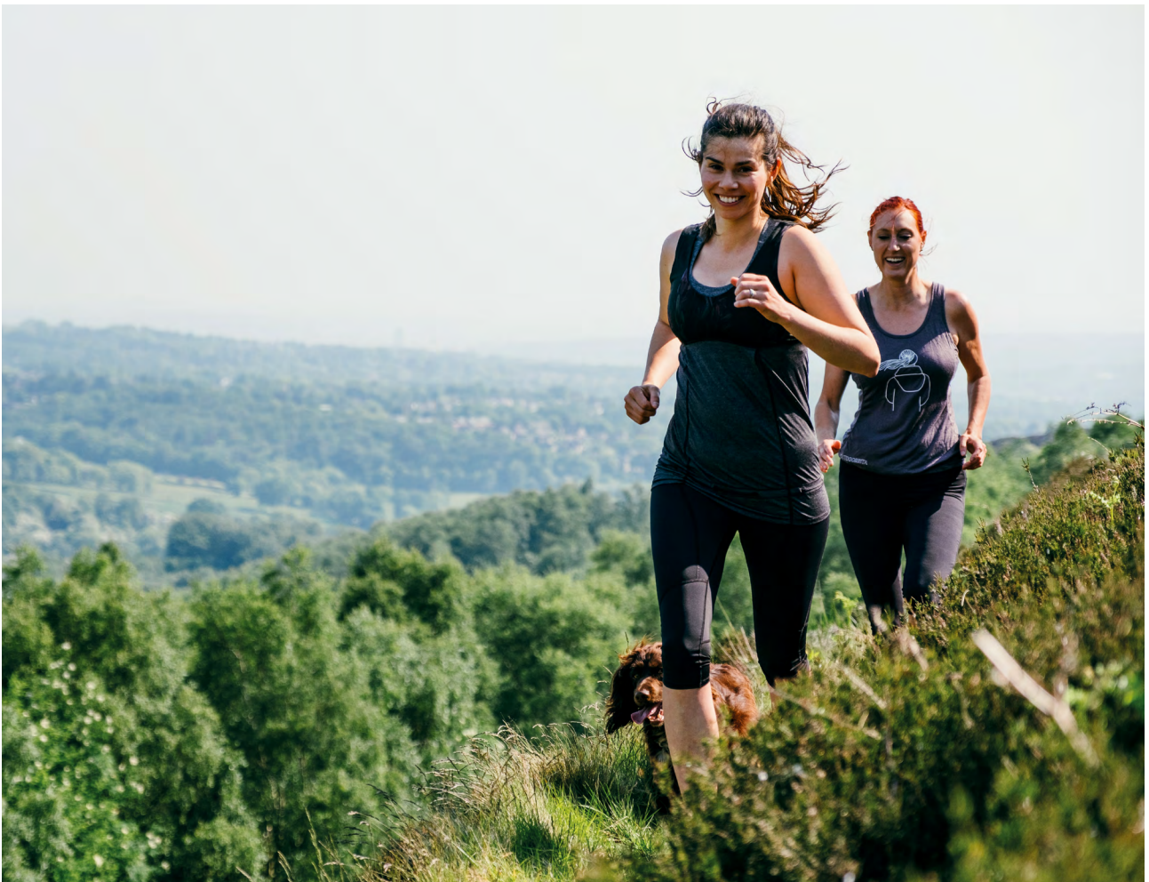
Runners in Sheffield

From 17 September 2021, to better reflect the geography that the mayoralty covers, its official titles and branding were changed to the 'South Yorkshire' Mayor and Mayoral Combined Authority. More information about this name change can be found here .