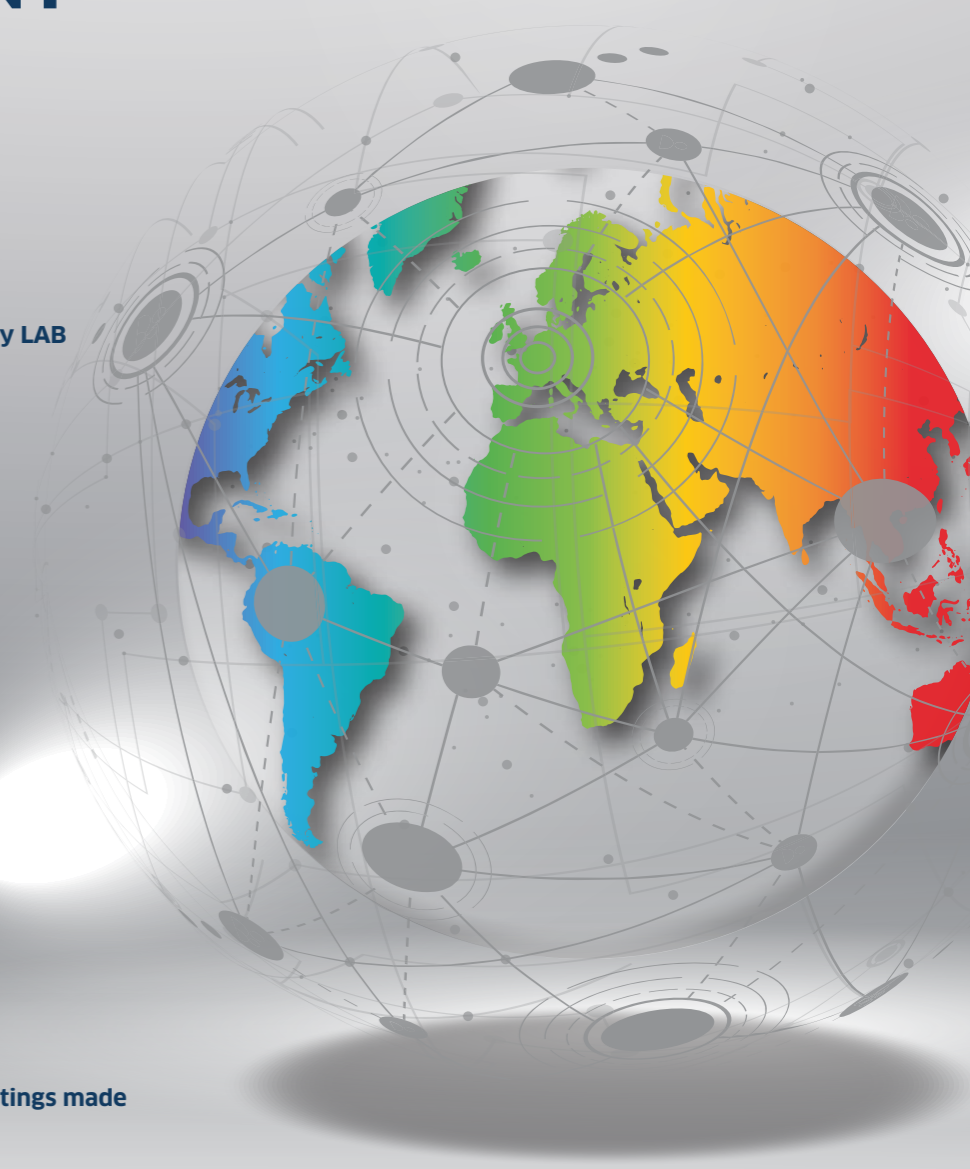
2018 key figures