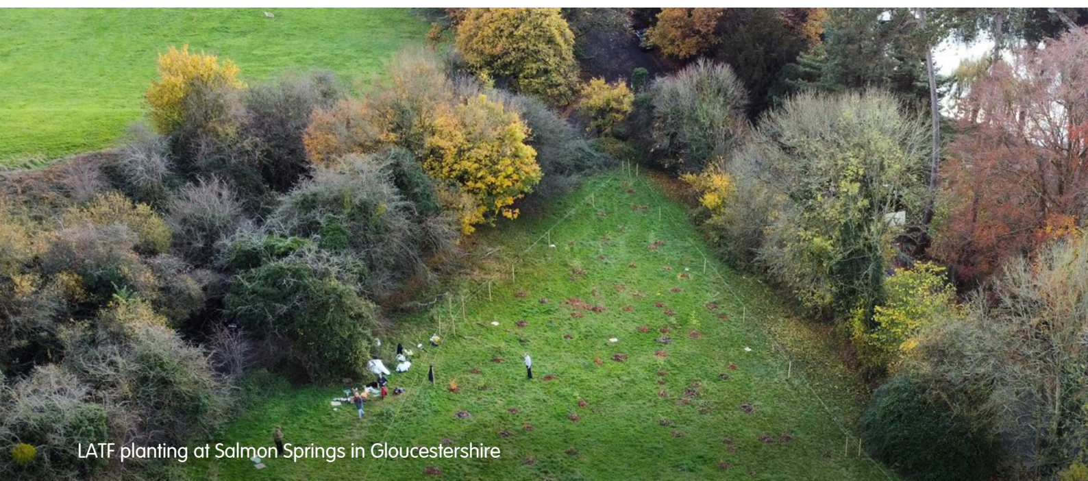
LATF planting at Salmon Springs in Gloucestershire

Meanwhile, the 'landscape' element will include work by the Farming and Wildlife Advisory Group (FWAG) to enhance a vital ecological corridor between the Dixon Hill and Bredon Hill sites of special scientific interest (SSSI), enabling passage for the violet click beetle from the latter special area of conservation (SAC). Further volunteer-led work will provide space and activities for people to reconnect with nature. The Wotton Area Climate Action Network and Stroud Valleys Project will be planting in farms, schools, green spaces, roadsides, council housing, amenity areas and private land. Importantly, tree planting in Salmon Springs by the Stroud Valleys Project will help to reduce the risk of a re-run of the devastating floods of 2007.