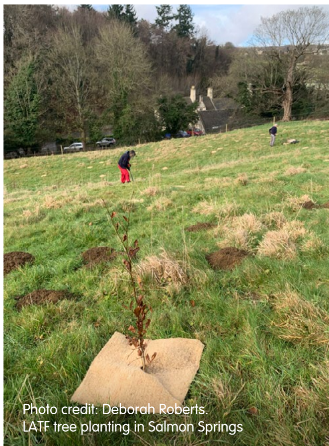
LATF tree planting in Salmon Springs