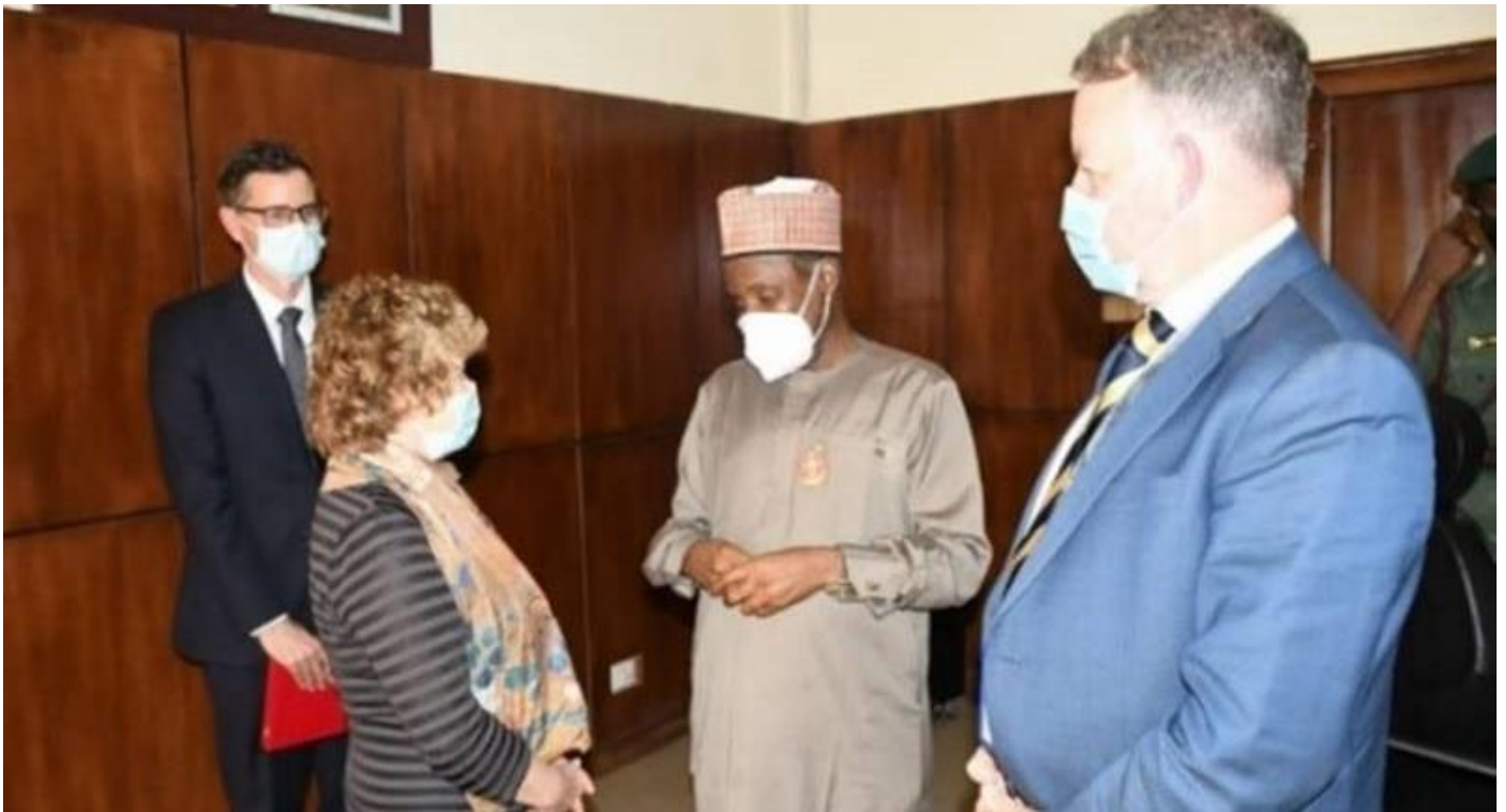
Nigeria: British High Commissioner, Catriona Laing and her Canadian and Australian counterparts speak with Minister of Defence, H.E. Major-General Bashir Magashi shortly after he announced his support for Nigeria's proposed membership of the VPI

and the Voluntary Principles 4 which demonstrated the relevance of the Voluntary Principles for Mozambique and set out the benefits of VPI membership. The briefing note was distributed widely throughout the country and translated into English, Portuguese 5 and Swahili 6 .