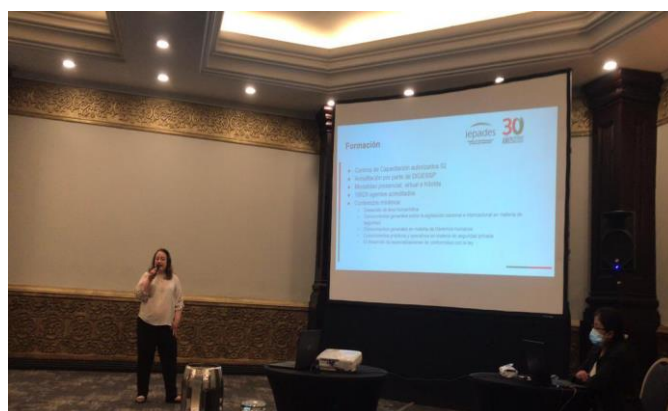
Guatemala: DCAF and IEPADES- Teaching Institute for Sustainable Development's presentation to the Voluntary Principles WG

In accordance with the VPI Government Pillar Verification Framework, and in support of increasing transparency within the VPI, the UK