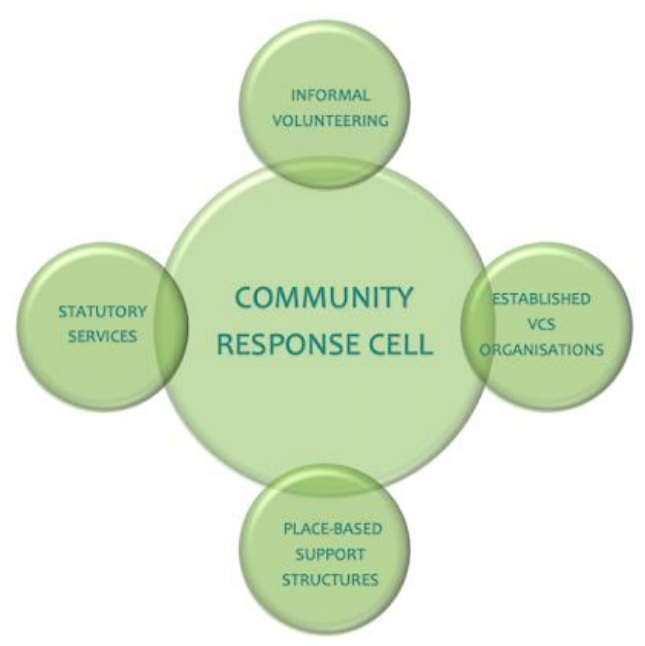
Model 3: Multi-agency response cells working directly with community networks and new informal networks

This model involved a more direct interaction between the LA and a network of community organisations. Multi-agency, cross-sectoral response teams were established in order to coordinate the response and provide support.