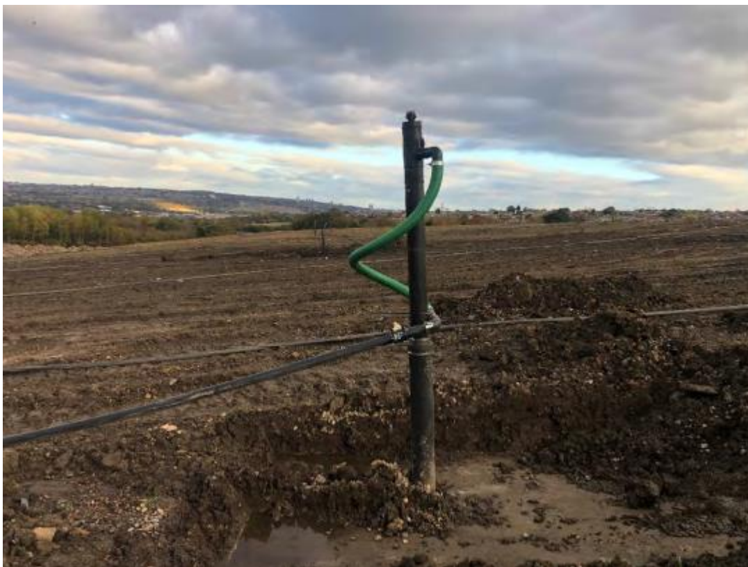
Completed gas extraction well