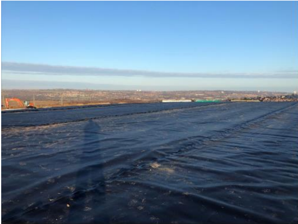
Wider capped area (cell 8)