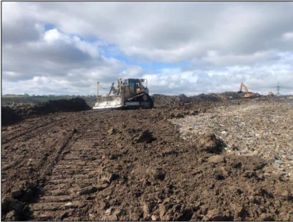
Deployment of pre-capping soil layer