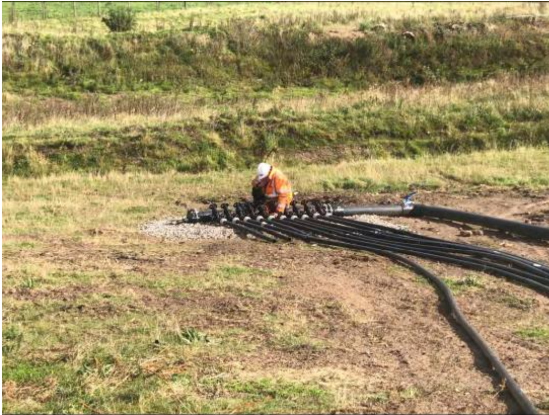
Connection of gas wells into wider system