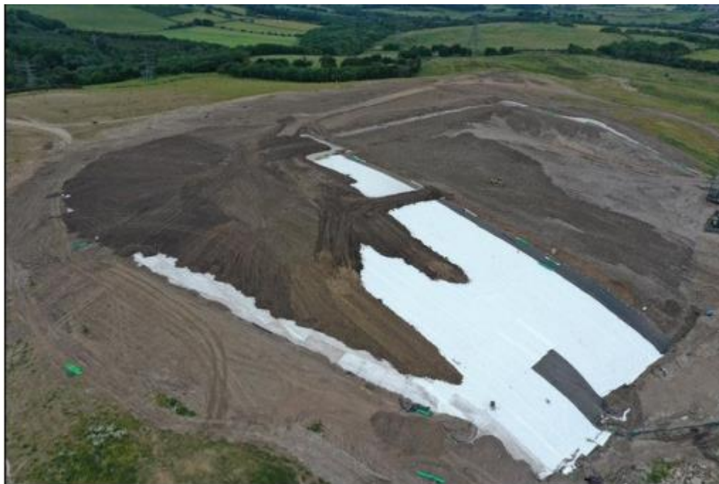
Aerial view of works in progress