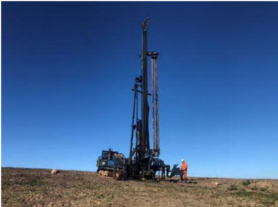
Drilling rig on site, installing landfill gas extraction wells