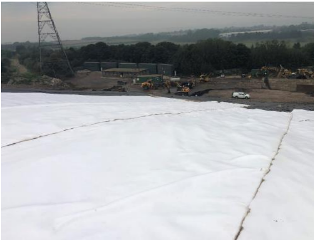
Protective geotextile (white material)