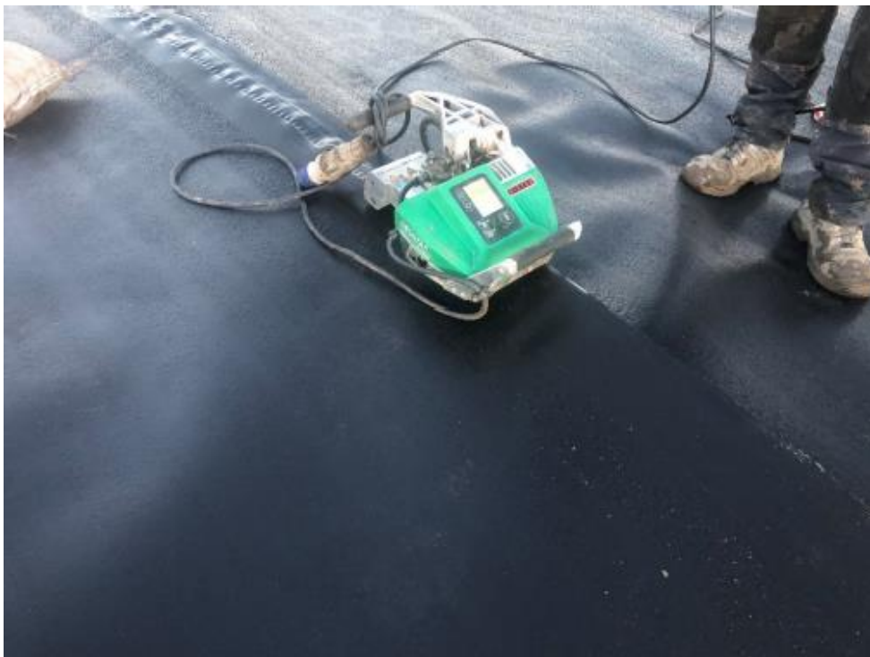
Welding together geo-membrane layers