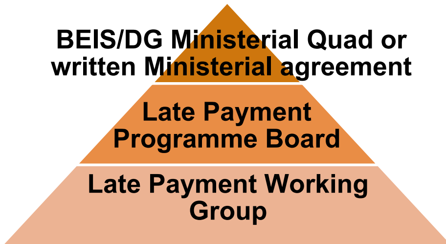
Figure 1: Decision making diagram