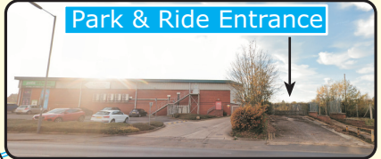
Park & Ride Entrance