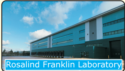
Rosalind Franklin Laboratory