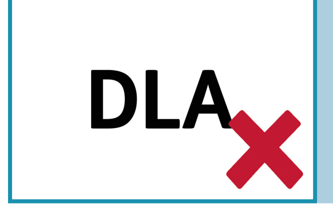
If this is not done, their Disability Living Allowance for children may stop.

It is important to make a Personal Independence Payment claim before or by the date stated in the letter.