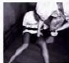
CD9054422-soldier from 1st