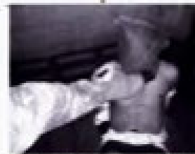
CD9054508-soldier from 1st