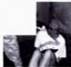
CD9054478-soldier from 1st