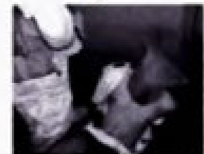
CD9054433-soldier from 1st