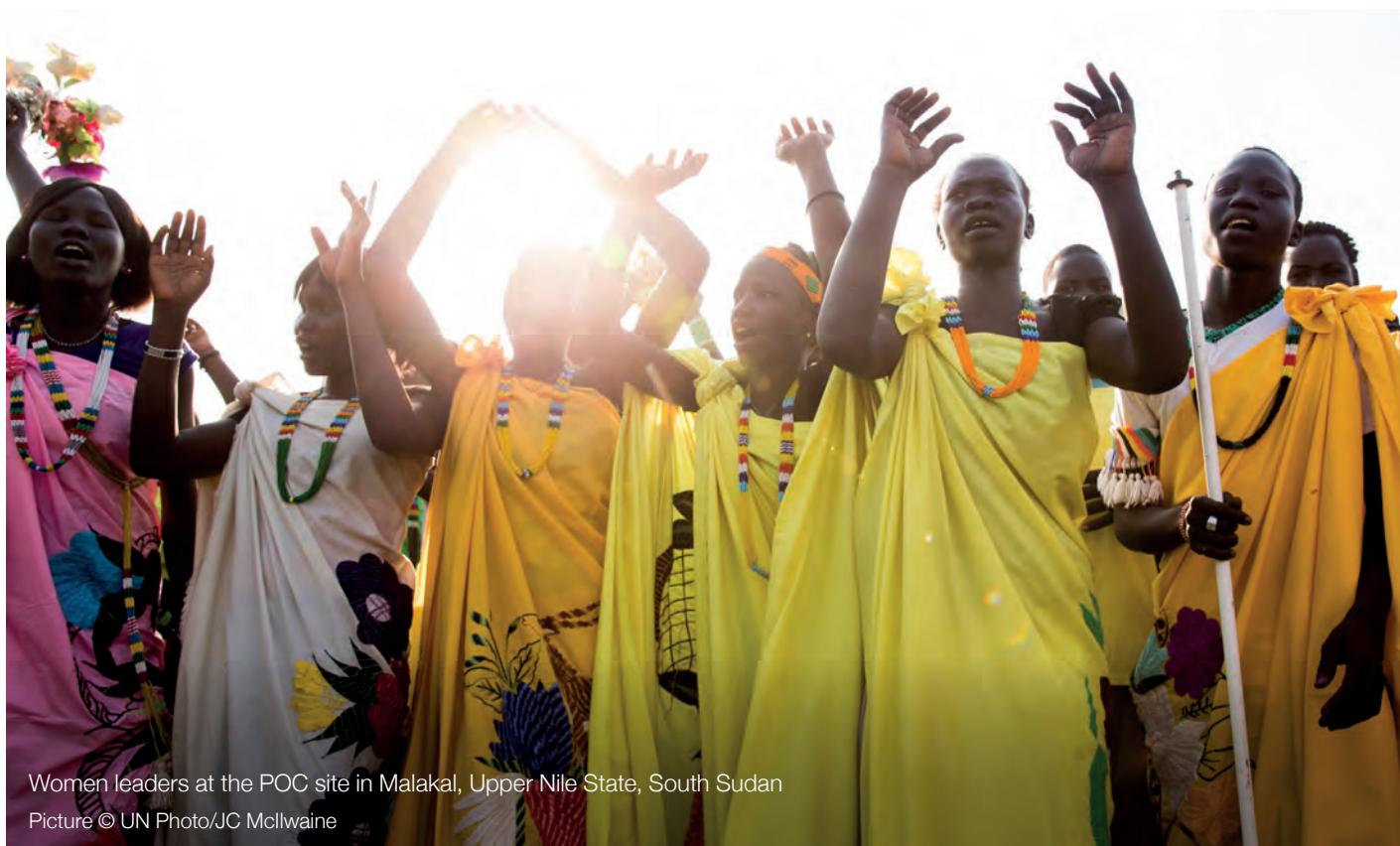
Women leaders at the POC site in Malakal, Upper Nile State, South Sudan