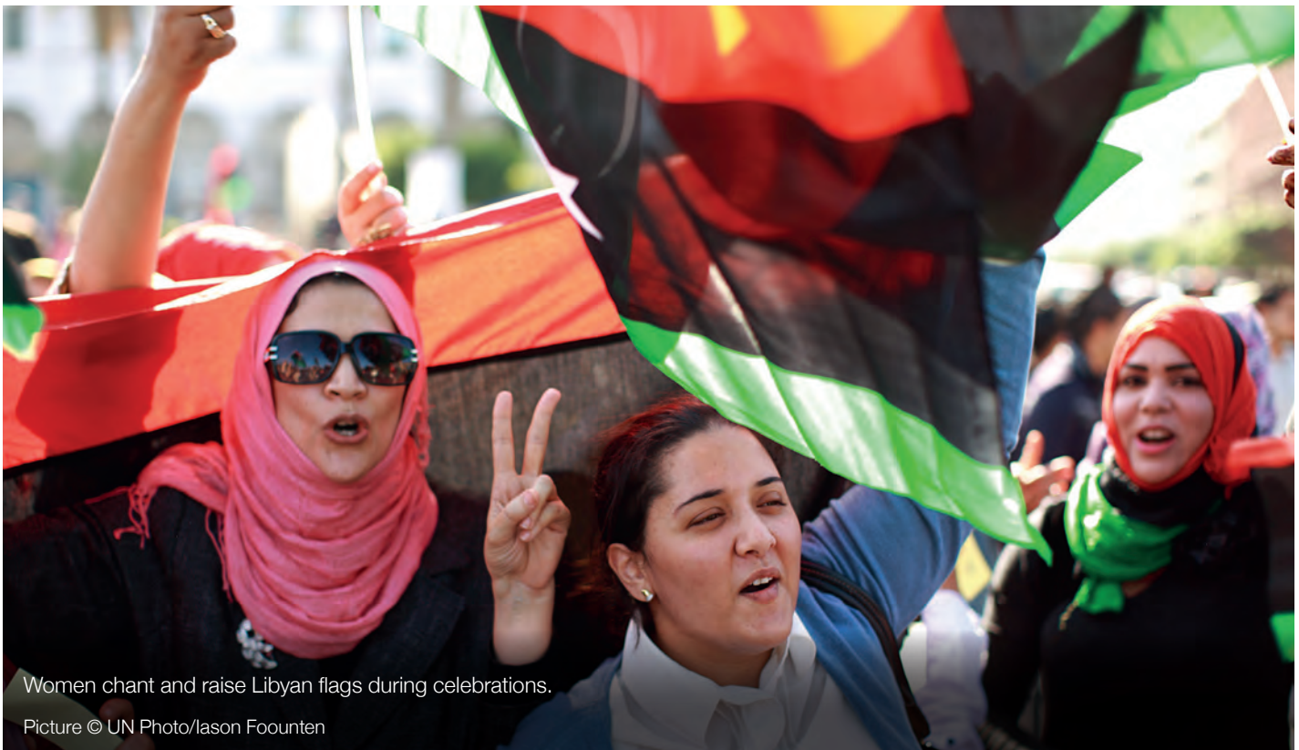
Women chant and raise Libyan flags during celebrations.