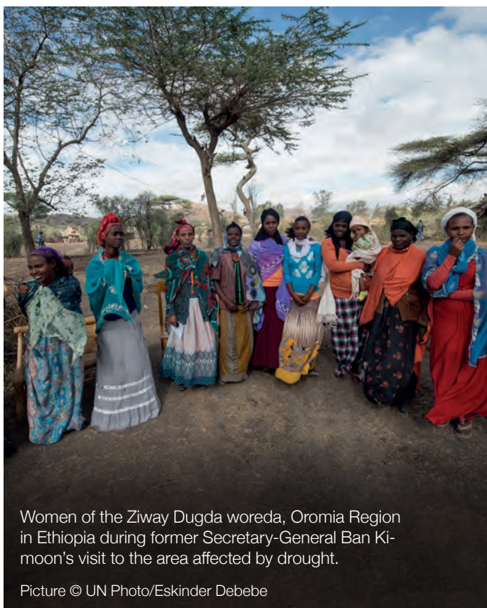
Women of the Ziway Dugda woreda, Oromia Region in Ethiopia during former Secretary-General Ban Ki-moon's visit to the area affected by drought.

The UK has partnered with Oxfam to empower women's organisations at the grassroots level in Iraq, the Occupied Palestinian Territories and Yemen to empower them to influence decision makers at national and provincial levels to be more responsive to the practical needs and strategic interests of women in the region and to hold them to account. Women from these groups attended the Open Debate on WPS in New York in October and presented at a side event on "Promoting the Needs of Women in Conflict in the MENA region". In Nigeria, DRC and Afghanistan, Women for Women International have run a UK-funded Men's Engagement Programme to raise men's understanding and attitudes towards violence against women, the value of women's work, girls' education and women's participation in community activities.