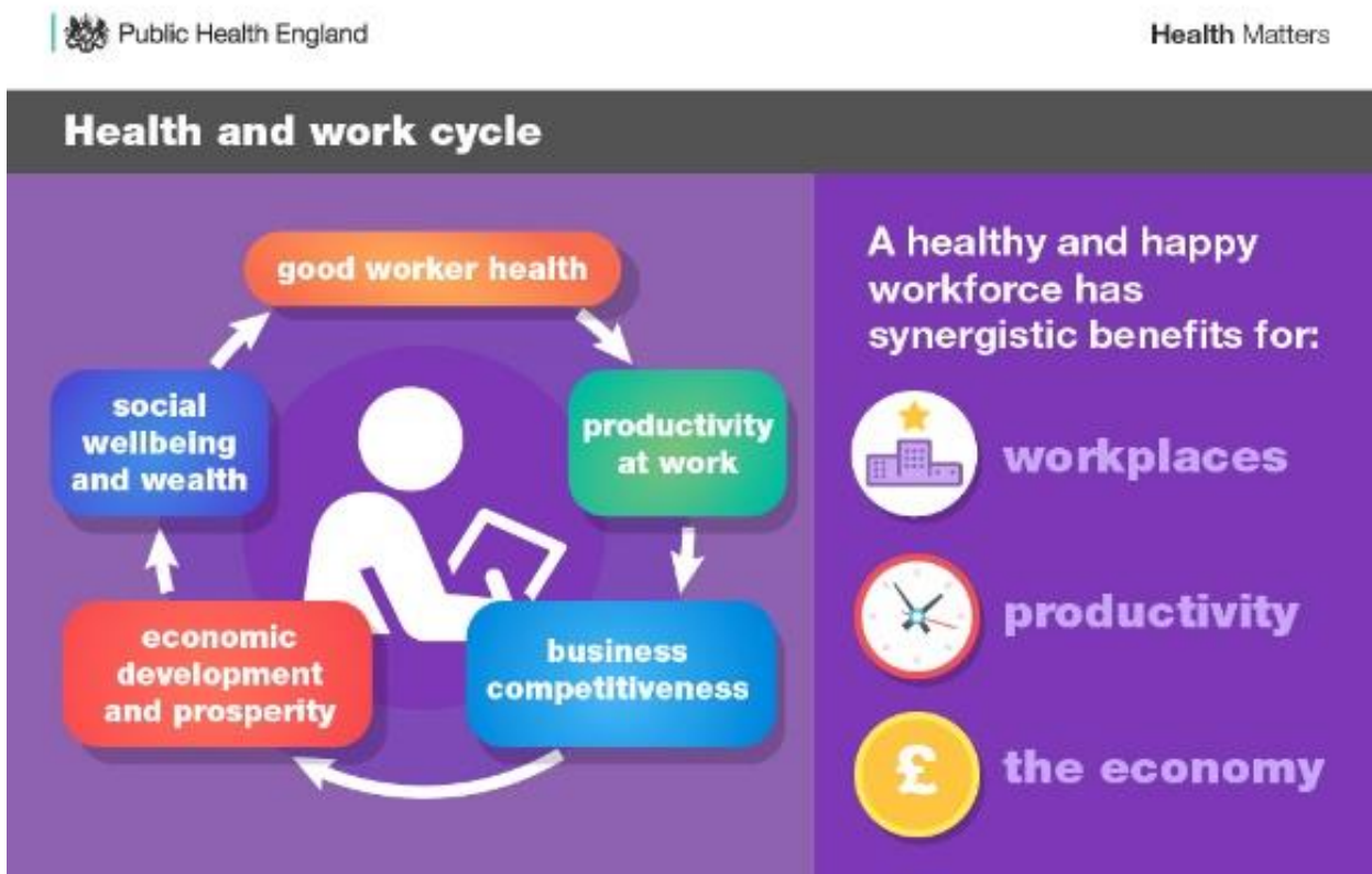
Figure 1. Health and work cycle 3

Worklessness is defined as ‘a state where an individual or no one in a household aged 16 and over are in employment, either through unemployment or economic inactivity’ 4 . In England there are 13.4% households that are classed as workless 5 and of these the majority (33.5%) are due to sickness or disability.