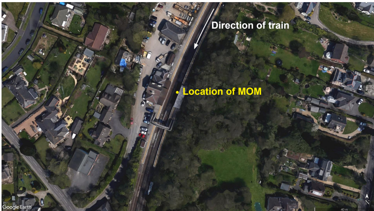
Figure 2: Aerial view of Rowlands Castle station showing the direction of travel of the train and the approximate location of the MOM immediately before the incident