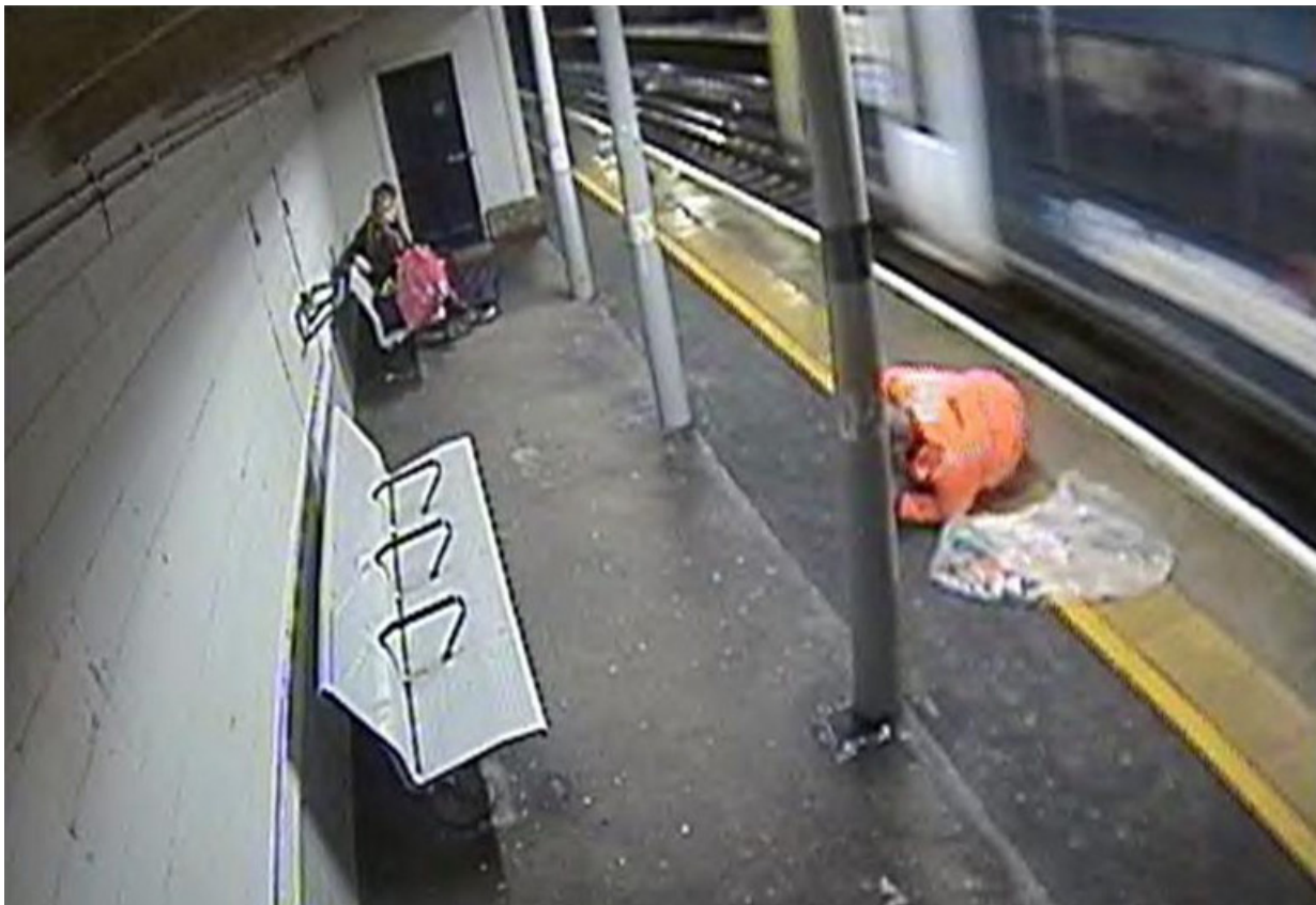
Figure 4: Station CCTV image of the moment the train passed the MOM – train travelling from right to left