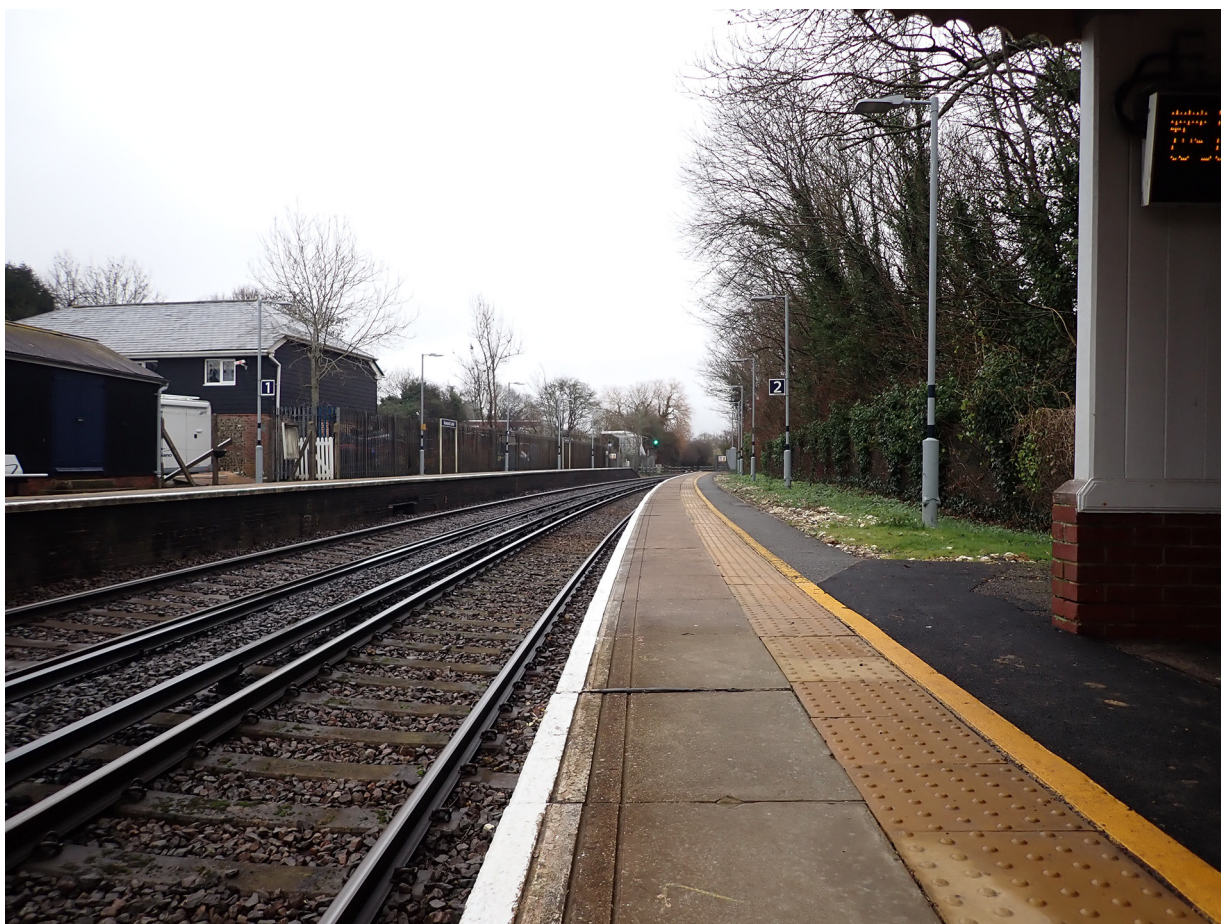
Figure 3: View from the approximate location of the incident, looking towards approaching trains