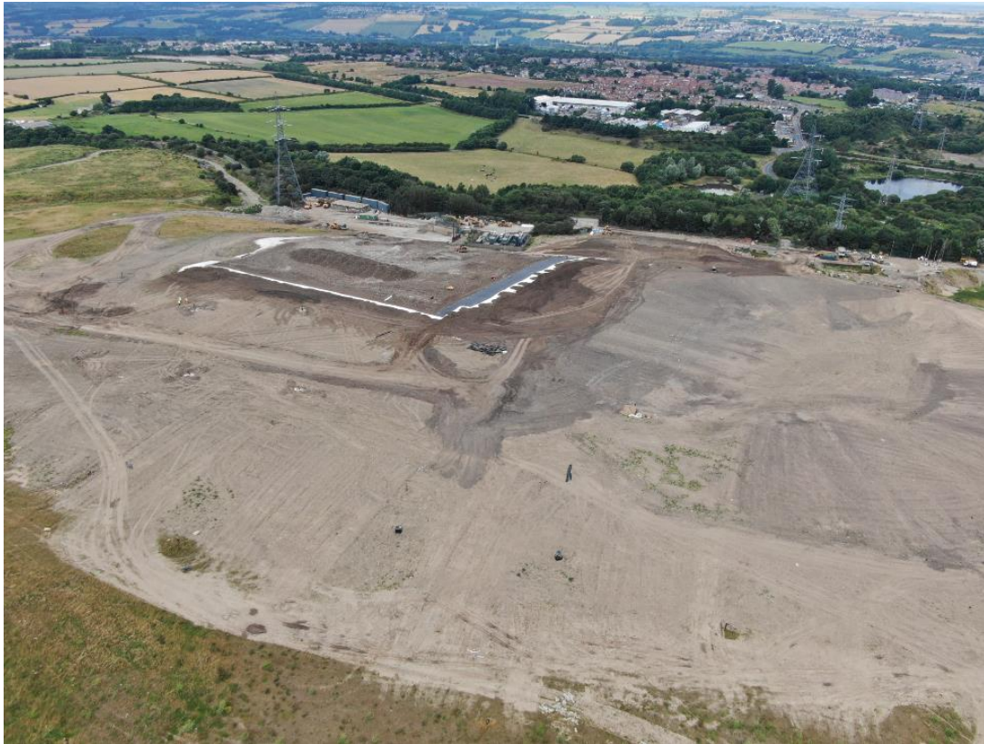
Looking towards cell 8 from above cell 6, with Stargate in the background