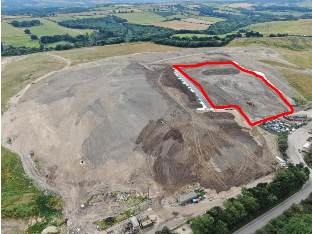
Cell 8 from Lead Road, with area still to be capped marked in red. Infrastructure visible below this area is the gas engine compound.