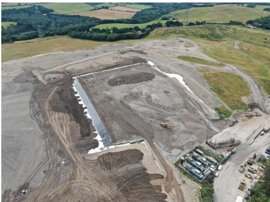
Another perspective of the remaining area to cap with cell 7 and cell 2 off to the right.