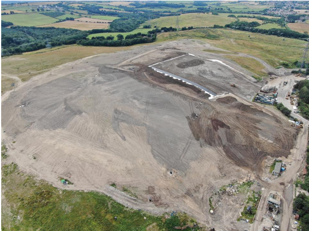
Cell 8 from 'traffic light' corner of the site. You can see the old Tarmac/Tilcon weighbridge in the bottom right corner from the sites' days as a working quarry.