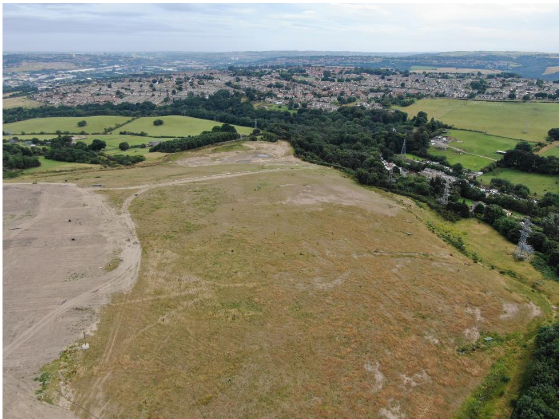
Cell 3 (along Longridge road boundary) with cell 6 (unseeded) to the left. Southeast surface water lagoon/soakaway to the top of the picture with a small puddle in.