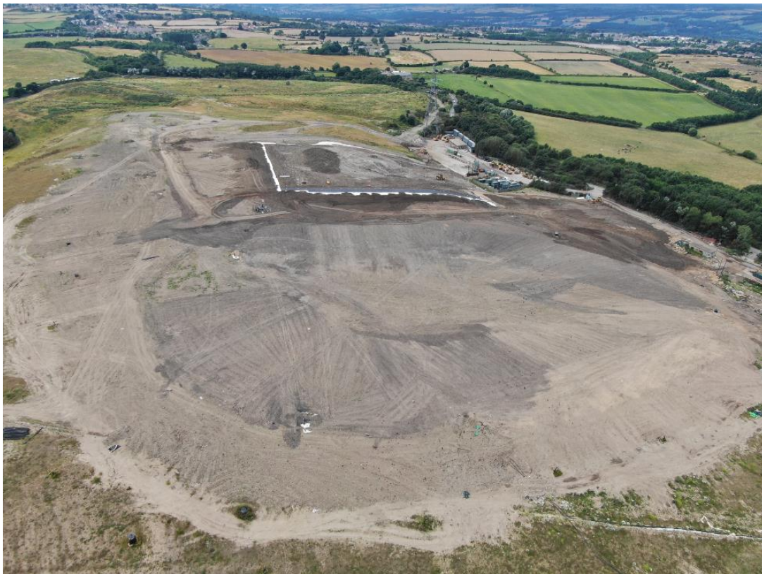
Cell 8 from above cell 5 (at Liddell's Fell Road boundary), with cell 7 and the old phase 1 landfill in the background