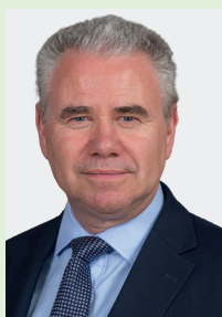
Professor Malcolm Morley OBE.