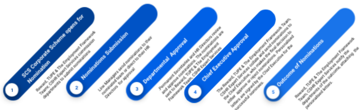
SCS Corporate Recognition Scheme Flow Chart