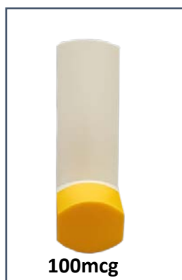
Figure 1 Clenil 100mcg inhaler subject to the batches supplied since May 2020 (to be discontinued)