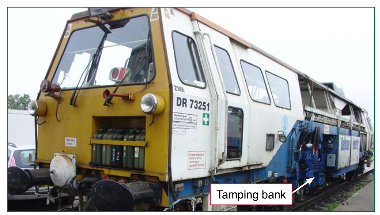
Figure 1: Plasser 07 series tamping machine showing position of the tamping banks