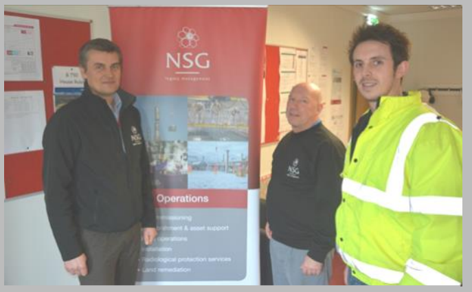
Above: NSG continue to deliver for the PCM Programme in 2015, and left, LLWR and Graham Construction win a Green Apple award in London, in 2018. The awards promote environmental best practice.

Much of the programme's massive success was attributed to this 'one team' approach, and the lessons learned went on to