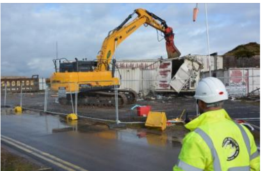
Top: Personnel working in air-fed suits bag PCM in a Magazine Retrieval Facility (MRF), the blue buildings built on to the front of the magazines, as shown above in 2008, constructed in the 1990s, for containment of the contaminated material. Above right, Magazine 3's MRF is demolished and below, the magazines today, free from contamination and ready for demolition.