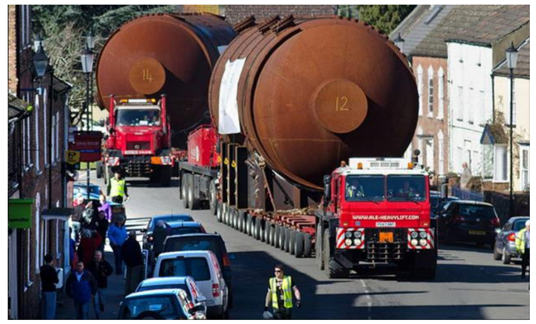
Under LLWR's landmark Berkeley Boilers project, 2012/13, 15 redundant 300 tonne steel boilers, each 22m long, were transported four miles through Berkeley town centre and on to the coast for shipping to Sweden. Around 95% of the steel was recycled for reuse.

The results are clear: a huge increase in the volume of waste diverted from disposal at the Repository, preserving valuable capacity for future generations and ending the concern that a second repository may be required at a cost in excess of £2 billion.