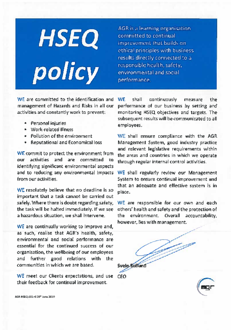
Figure 2 - HSEQ Policy

AGR is aware of the potential environmental implications of its business operations and is fully invested in safeguarding the environment as an underlying principle of our operations. This is demonstrated by the commitments outlined in the HSEQ policy underpinning our HSEQ Management System and all our activities. Following the principles of ISO14001, the HSEQ policy commits AGR to enhance our environmental performance, meet all identified compliance obligations and to protect the environment.