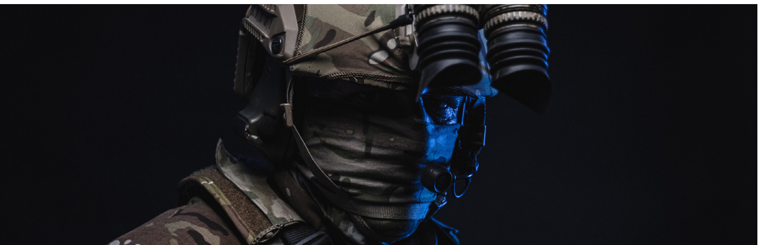
Ben Wallace MP

A handwritten signature in black ink that reads "Ben Wallace".