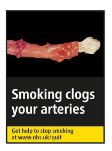
SET: 13 Pictures