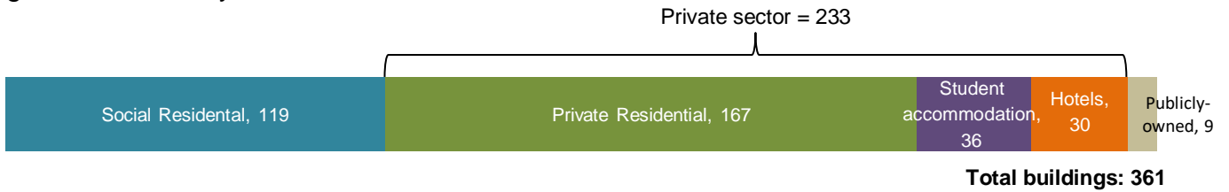
Figure 2: Progress on remediation for buildings where ACM cladding systems unlikely to meet Building Regulations remain in place 1