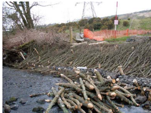
Live willow fascines