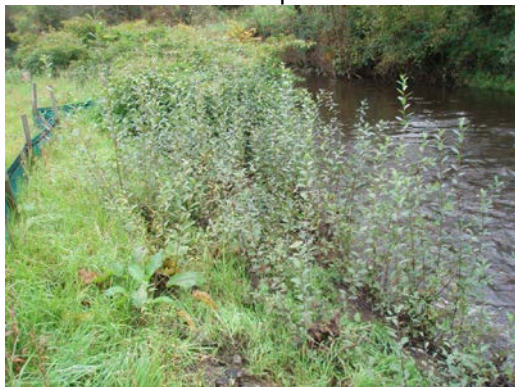
Established bankside vegetation (one-year later)