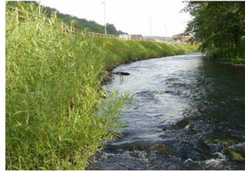
Established vegetation (one year later)