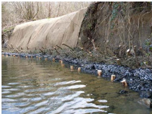
Erosion control and toe protection

The bioengineering design solution involved locally harvested willow material which was used as live stakes and the thinner branches used to form live fascines (faggots). A double rock roll was placed at the toe to prevent the willow plantings from being undercut and to protect against abrasion from the mobile gravel/cobble bedload.