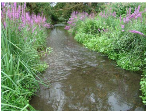
Established vegetation (five months later)