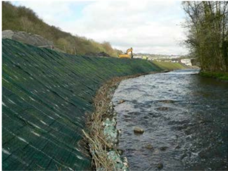
Erosion control matting and toe protection (rock roll and willow brushwood faggots)

The toe of the river bank was protected using a combination of rock rolls and living willow brushwood faggots. The upper bank was protected using two high-performance erosion control mats. Before laying the matting, the re-profiled upper banks were seeded with a reclamation mix of grass and legume species.