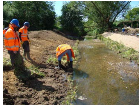
Re-profiled banks and installing pre-vegetated coir pallets