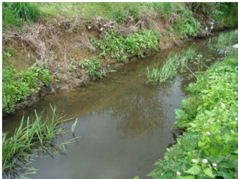
Steep eroding banks

Salix designed and constructed a 40 metre enhanced channel. Imported flint reject stone was used to create in-channel features, two riffles and a point bar. The gravel has concentrated the low flows and revived water flow in the reach. Diverse marginal and bankside vegetation was established using mature pre-established coir rolls and pallets. Locally harvested tree trunks were used to create a double flow deflector. Additionally, a large backwater was created on line and just downstream of the enhanced reach.