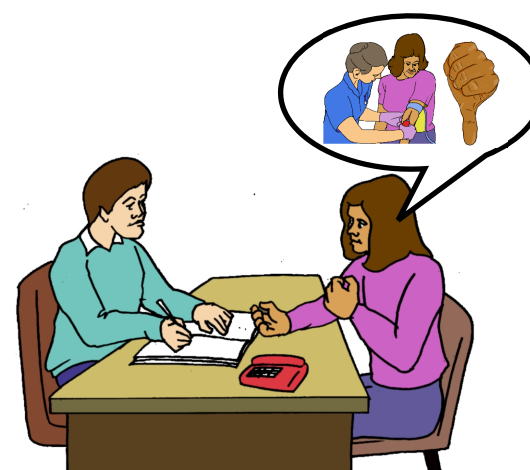
Feedback and complaints