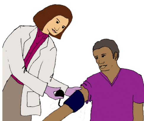
Good, safe care