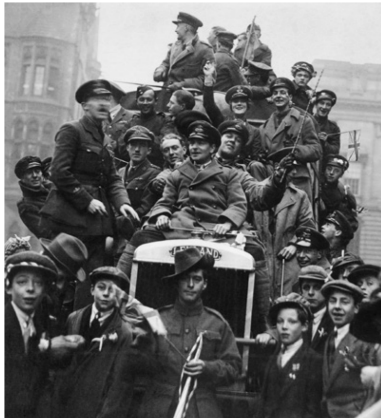
Armistice celebrations in Birmingham.

News of the end of the First World War travelled far and wide on 11 November 1918. The following pages feature recollections from people across the UK and the world who experienced the news of the Armistice at first hand.