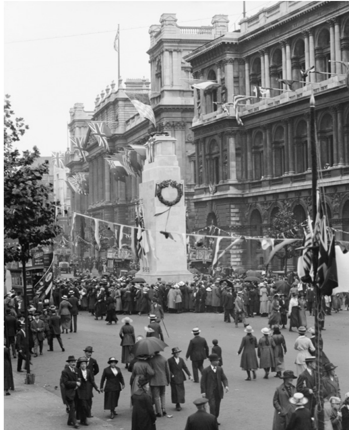
Spectators after the parade at the Cenotaph, Whitehall, 19 July 1919.

Whitehall, where they marched past a temporary memorial created for the occasion. Designed by Sir Edwin Lutyens, it took the form of an empty tomb, or Cenotaph. Soon, wreaths and flowers were piled high at its base. It proved so successful that a permanent version was commissioned, and unveiled the following year with a simple inscription to 'The Glorious Dead'.