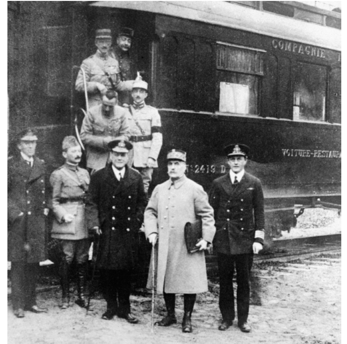
French Military and British Naval Representatives outside the train where the Armistice was signed.

general ceasefire were refused. Meanwhile, Germany was in turmoil, with a Republic declared on 7 November and riots in Berlin. Emperor Wilhelm II abdicated two days later. It was clear that the armistice terms would be devastating, but there was little option other than to accept.