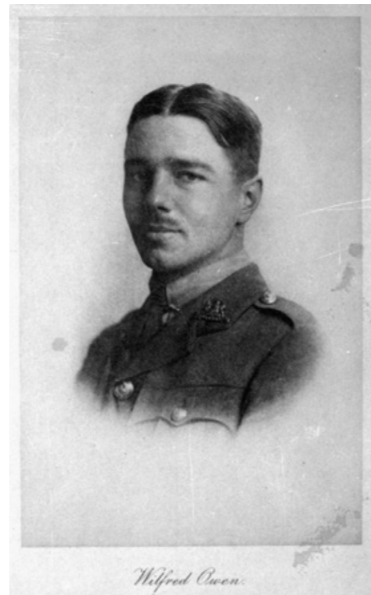
Portrait of Wilfred Owen

closer to the familiar territory of the Belgian mining town of Mons, where the British Expeditionary Force had first confronted the German Army in 1914. Meanwhile, Belgian forces advanced through Flanders and along the Belgian coast, reaching Ghent by 11 November. On the right of British and Empire forces, French troops crossed the Aisne early in November and pushed on towards Mezières, while American forces advanced up the valley of the River Meuse towards Sedan.