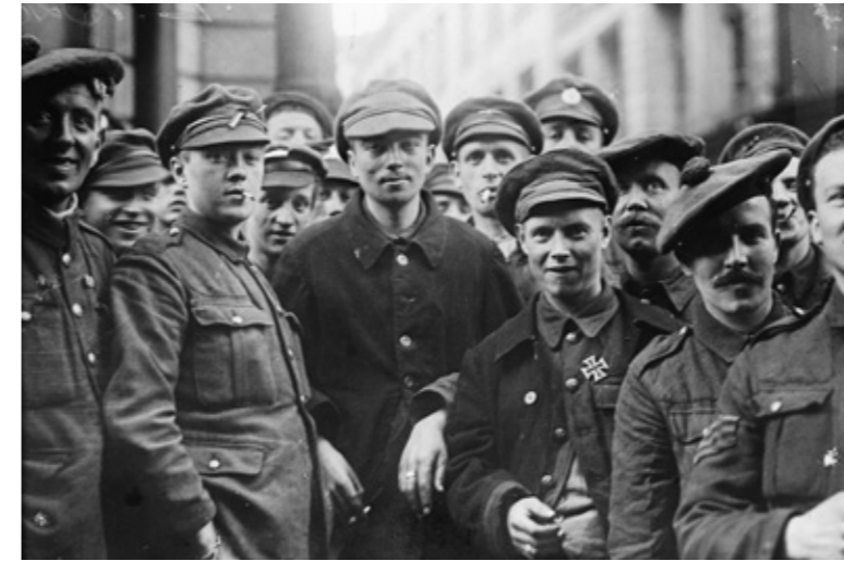
The first released British prisoners to reach Tournai, 14 November 1918. © IWM (Q9688)

11 a.m., and are believed to be the last British and Commonwealth combat casualties on the Western Front.