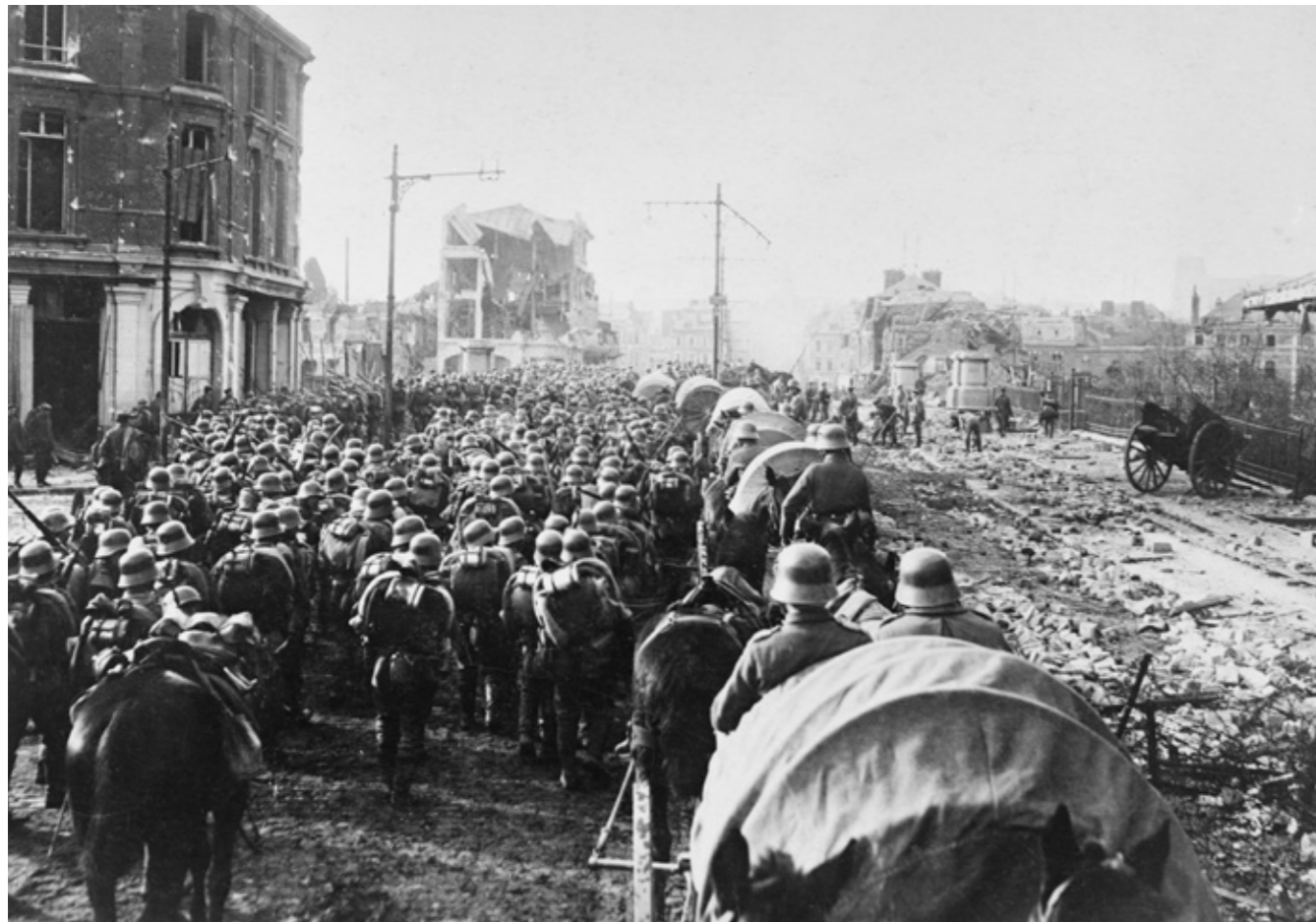
German troops concentrating in the wrecked streets of St. Quentin, immediately prior to the Spring Offensive, 19 March 1918. © IWM (Q55479)