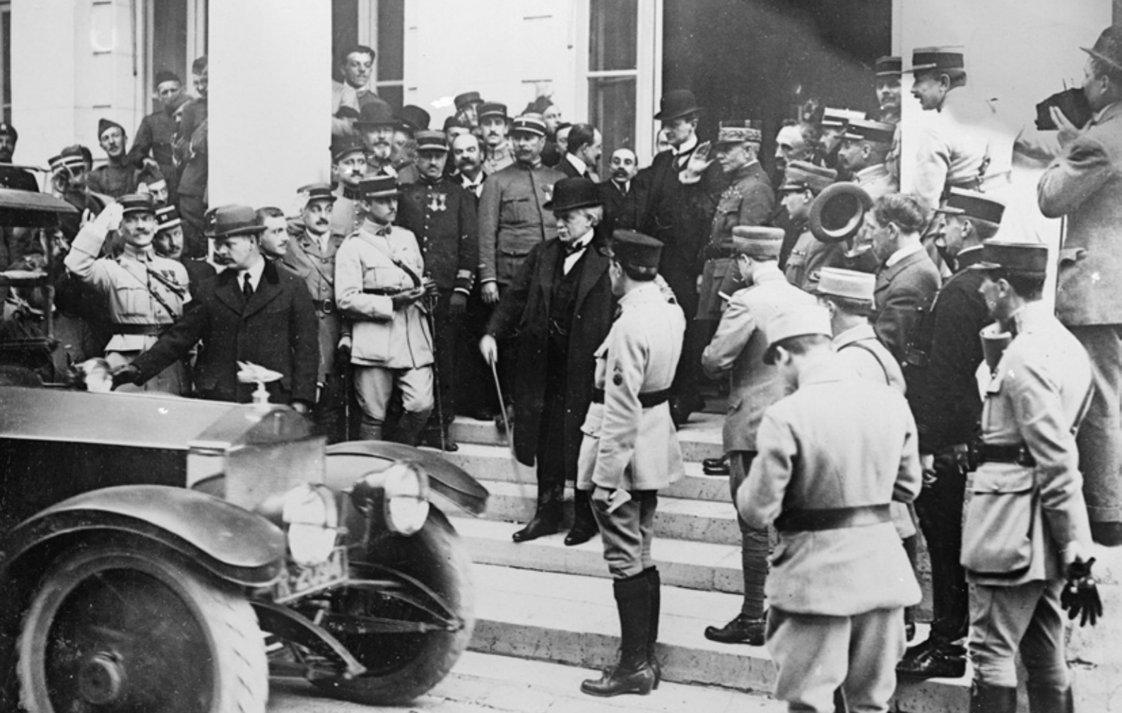
Prime Minister David Lloyd George leaving the Trianon Palace, Versailles, after the signing of 7 May 1919, when the terms of the Peace Treaty were handed to the German delegates.

By this time, thousands of troops from across Africa and India had been brought into the conflict under British command, along with hundreds of thousands of African carriers. Their war was often horrific, transporting weapons, equipment and supplies by hand across hostile terrain. Even today, the precise number who perished is still not known, but at least 100,000 – perhaps as many as 1 in 5 – are thought to have succumbed to exhaustion, malnutrition or disease, carried by the deadly tsetse fly. Both sides relied heavily on African manpower, as well as the resources of communities through which they passed. Entire villages were displaced, or saw their homes destroyed. Famine killed several hundreds of thousands of civilians.