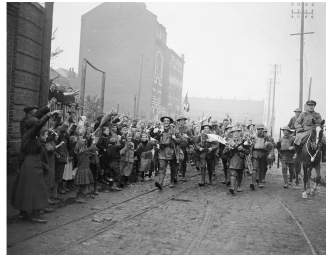
Troops of the 8th Battalion, the King's (Liverpool Regiment, Liverpool Irish, 57th Division) entering the outskirts of Lille, 18 October 1918.

On the battlefields, Allied soldiers were aware of the ongoing negotiations, but continued to fight throughout the grey November days and rain-soaked nights. Their supply lines were stretched, roads became muddy swamps in the wet conditions, and German troops demolished bridges and set booby-traps on delayed action fuses. While the civilians of newly-liberated villages often greeted them with joy, there was disagreement among Allied commanders about whether further casualties could be justified.