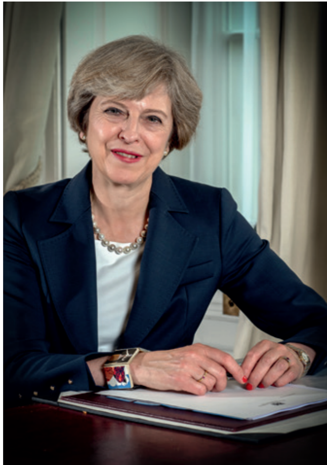
The Right Honourable Theresa May MP The Prime Minister of the United Kingdom of Great Britain and Northern Ireland