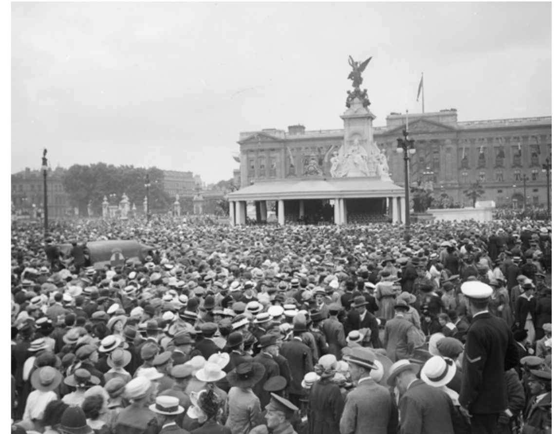
Spectators outside Buckingham Palace after the parade, 19 July 1919.