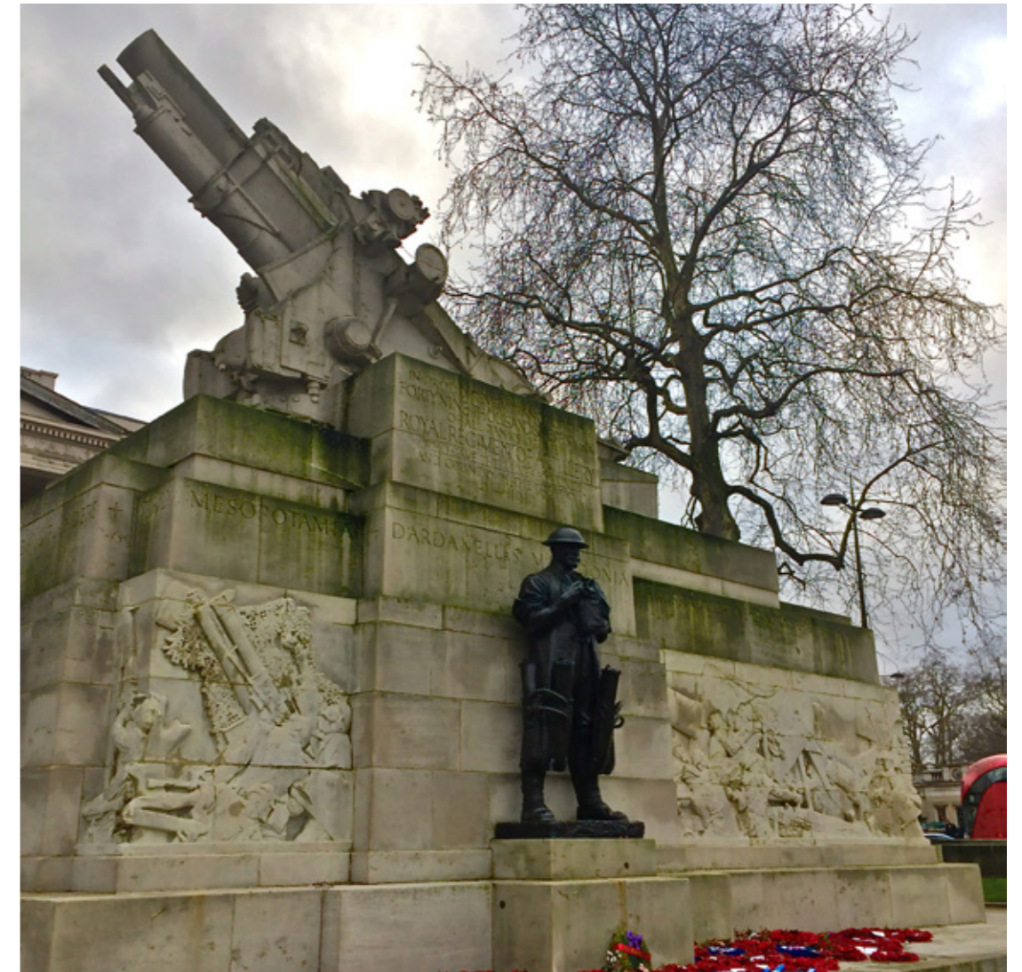
Royal Artillery Memorial, Hyde Park Corner, London (1925) by Charles Sargeant Jagger.

Little Comberton war memorial in Worcestershire has been conserved following a grant from the First World War Memorials Programme administered by War Memorials Trust. The names painted in black are those who fought and returned from the war while the names of the fallen are gilded.