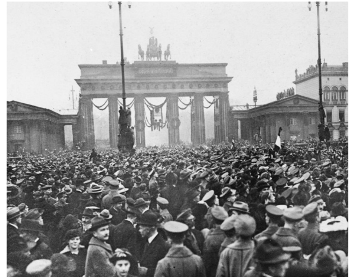
A mass demonstration marches down the Bellvuestrasse, Berlin. The placard held by one of the protesters reads 'We shall fight against any illegal seizure of power by the Right or by the Left.'

On the battlefields, the Armistice had brought with it an unnerving silence. At home, a cacophony of noise was the herald of peace. Guns were fired, sirens sounded, and bells rang. Bands played in street parades, wounded soldiers used tins