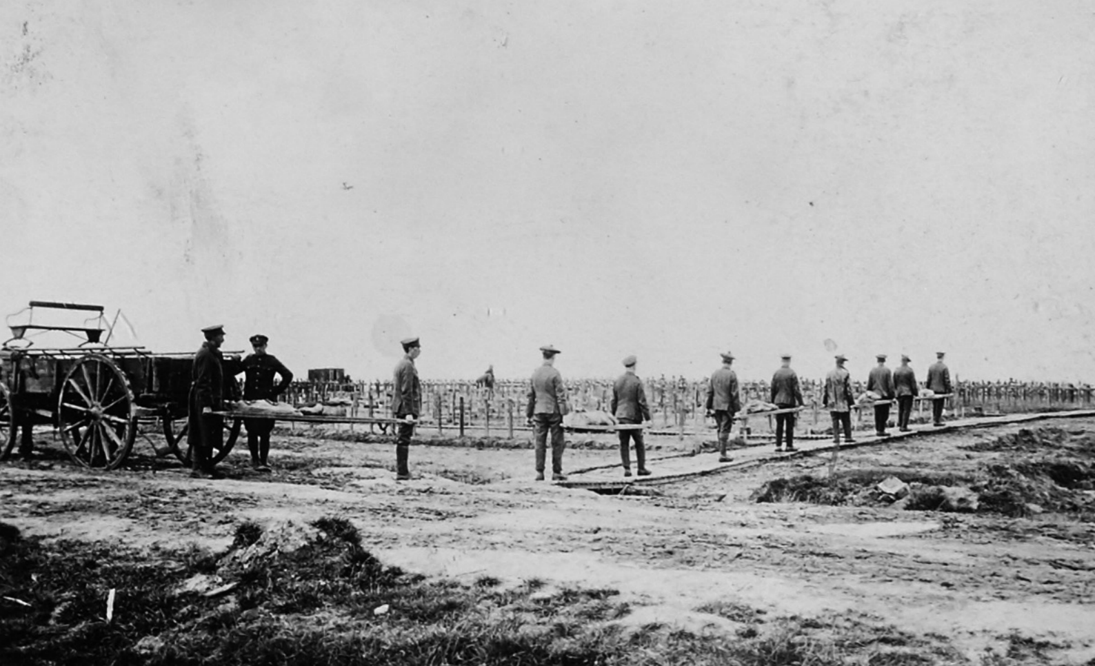
Grave Registration Unit burial party at Passchendaele New British Cemetery, Belgium 1919. Remains being unloaded from a wagon by a line of stretcher bearers and taken into the cemetery for burial.