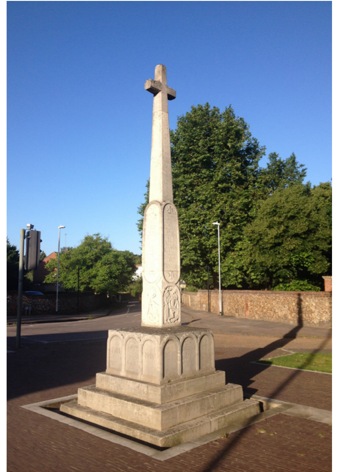
Trumpington War Memorial (1921) by Eric Gill.

home. Regimental memorials ranged from the deeply traditional to the boldly avant-garde. Adrian Jones's Cavalry Memorial (unveiled in Hyde Park in 1924) showed a St. George in bronze, his horse straddling