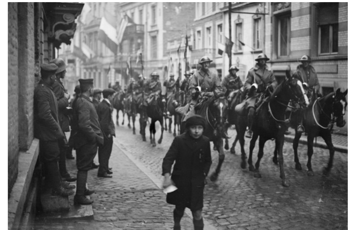
German soldiers watching the entry of the 2th Lancers into Spa, 29 November 1918.

Soldiers would later struggle to articulate how they felt at the moment the guns stopped firing. It was a mixture of joy, relief, numb disbelief, and grief at what – and whom – they had lost. Many described quiet moments among comrades, wordless handshakes and individual reflection. There was also, for many, a sense of achievement and justice at what they regarded as a significant victory. In a few cases, firing continued even after 11 a.m., but for most the tension and stress of war was quickly replaced with thoughts of the future, both hope and trepidation at what awaited them back home.