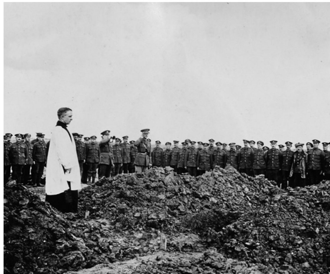
Burial party in Passchendaele New British Cemetery, Belgium 1919. An army chaplain conducting a funeral.

nations including Britain as well as India and China, whose government committed to assisting the Allies. First arriving near the front in mid-1917, tens of thousands of Chinese workers contributed to the efforts of British and French forces, particularly at dockyards, repairing roads or digging trenches. Almost 100,000 were in service with British forces between 1917 and 1920. With the end of hostilities, the Chinese Labour Corps helped with battlefield clearance: dealing with unexploded ordnance, filling in trenches, and recovering bodies. It was difficult, dangerous and often demoralising work carried out amongst the most horrifying circumstances.