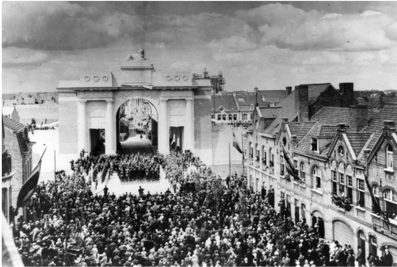
The unveiling and dedication of the Ypres (Menin Gate) Memorial, 24 July 1927.

Frederic Kenyon, Director of the British Museum, established the earliest tenets: that the memorials should be permanent, and that there should be no distinction made on the basis of rank or class, whether military or civilian. Furthermore, wrote Kenyon, 'no less honour should be paid to the last resting places of Indian and other non-Christian members of the Empire than to those of our British soldiers.'