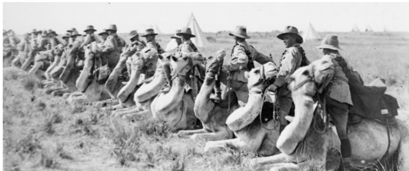
The advance through Palestine and the Battle of Megiddo: Australian members of the Imperial Camel Corps near Jaffa in Palestine.