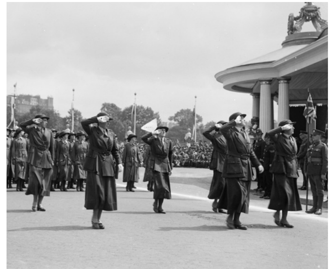
Members of Queen Mary's Army Auxiliary Corps saluting the Royal Box (Buckingham Palace). King George V taking the salute, 19 July 1919.

On 19 July 1919, 'Peace Day' celebrations marked the signing of the treaties in what the King termed 'a festival of victory'. A bank holiday was declared and festivities took place