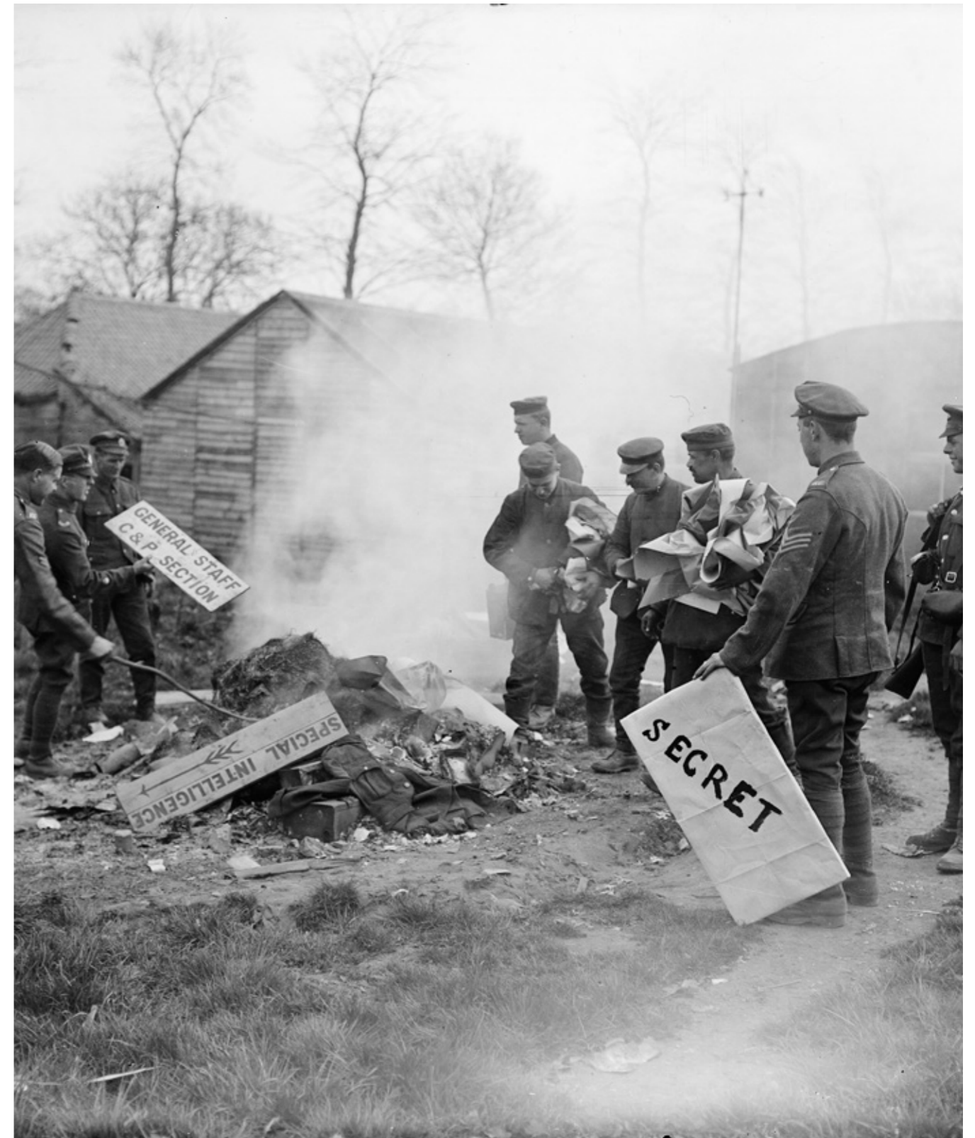
British soldiers and German prisoners burning old direction signs in the fire.

With the civilian populations along the old Western Front beginning the long task