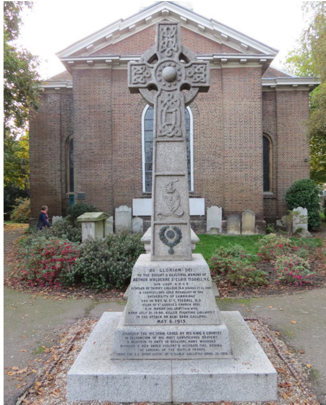
War Memorial at St. George's Church, Deal (1916).

responsible for one of the finest railway company memorials: "The Letter" stands on platform one at Paddington Station, a reminder that some of the finest modern sculptures of all were to remember the war dead.