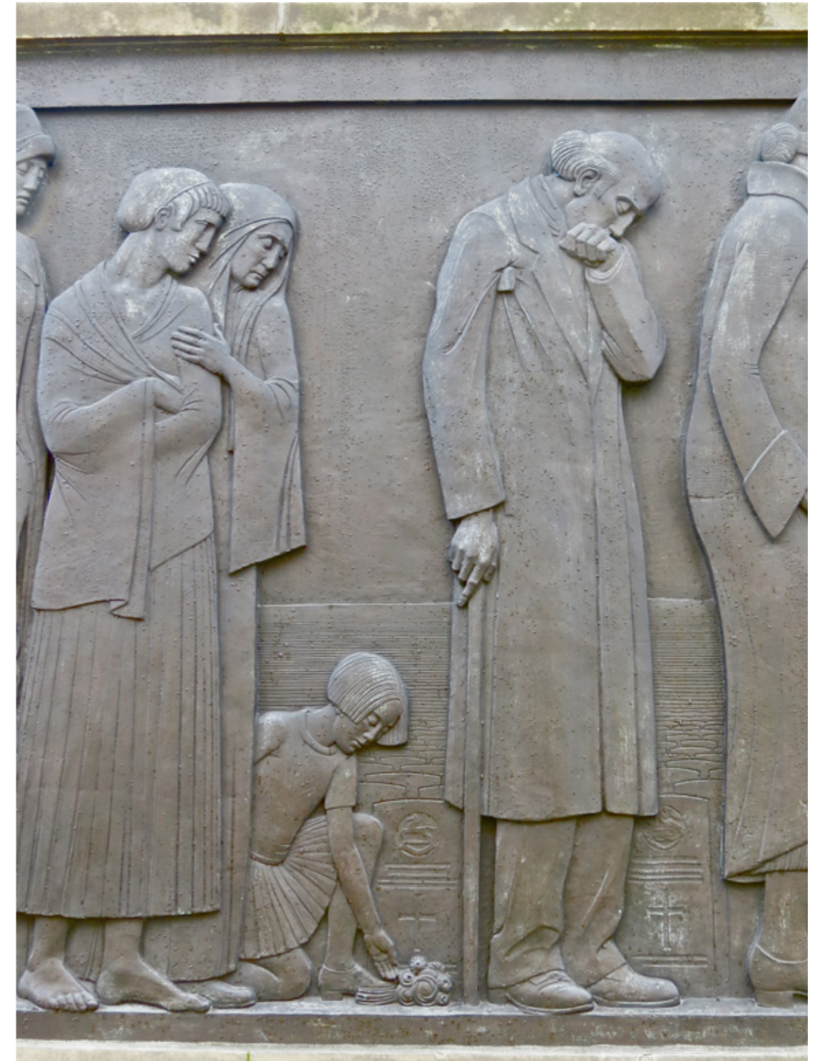
Relief of mourners from the Liverpool Cenotaph by Herbert Tyson Smith (1930).

person despatched to serve: there are over fifty of these so-called "thankful villages" – a tiny fraction out of the tally of 16,000 or so local communities. All of the others had to bear losses. And these could be devastatingly heavy.