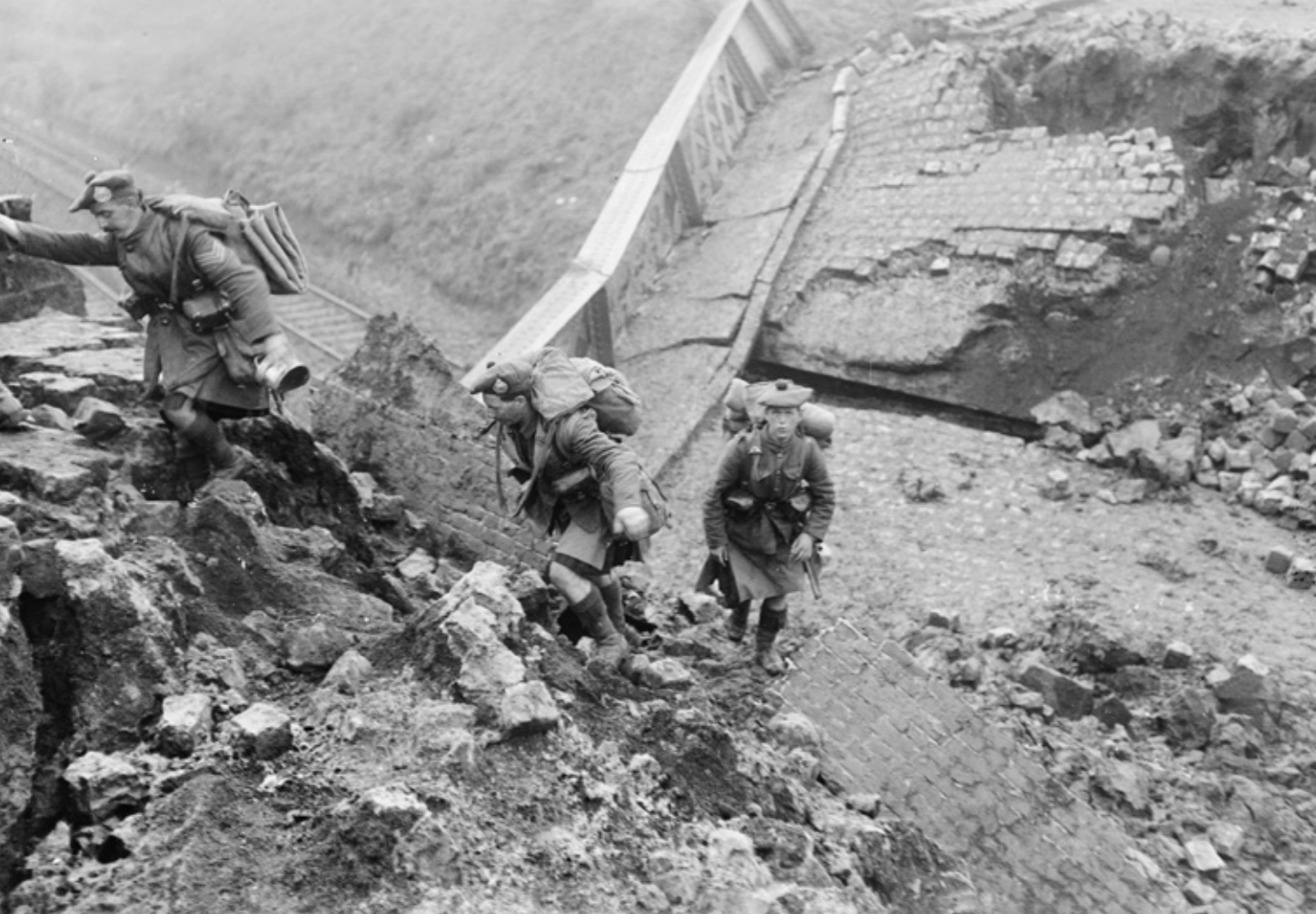
Argyll and Sutherland Highlanders of the 51st Division crossing the railway at Douchy-lès-Ayette by the ruins of the blown up railway bridge, 22 October 1918.

Retreating German forces attempted a last-ditch stand on the line of the Sambre-Oise Canal and at the Forest of Mormal near the Franco-Belgian border. Just before dawn on 4 November, infantry advanced through dense mist across difficult country behind a supporting bombardment. Heavy casualties were suffered during the British 1st Division's attack on the canal, while 32nd Division faced stern German resistance near Ors, where the poet Wilfred Owen was among those killed. Yet vital bridgeheads were eventually secured by infantry, sappers and pioneers. In the north, Allied infantry strove to drive the Germans from their positions within the dense woods of Mormal, while the ancient citadel of Le Quesnoy was dramatically captured by the New Zealand Division.