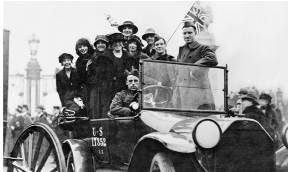
A group of people in an American automobile in London on the day the Armistice was signed, 11 November 1918. © IWM (Q65858)

street parties breaking out, particularly in big cities where crowds surged in public spaces and flags flew from buildings. In London, civilians mingled with troops from across the Empire.