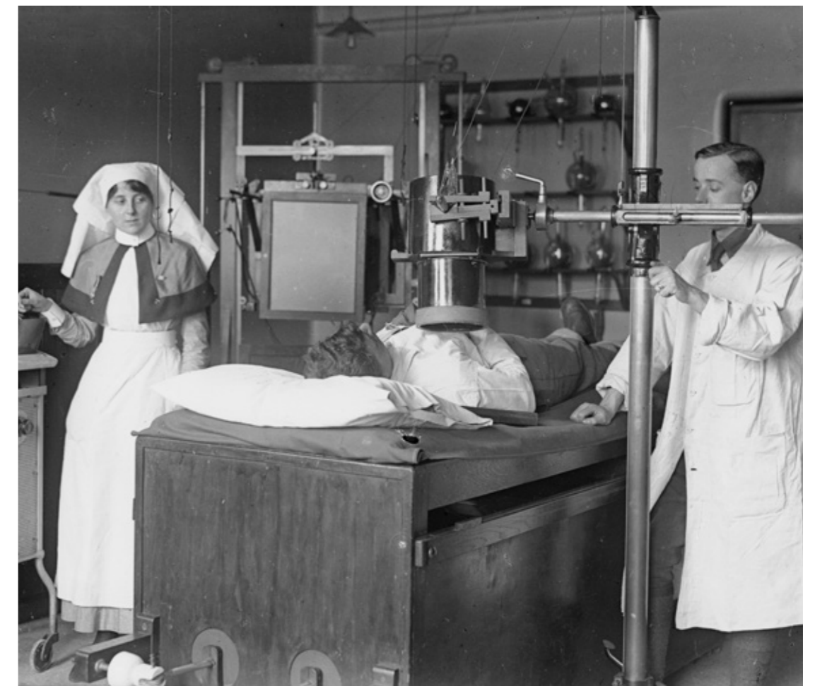
A man undergoing radiographic treatment, No. 4 London General Hospital.

Over 40,000 British servicemen suffered the loss of a limb, and thousands suffered damage to their sight. Around 80,000 had been treated for shell shock, but many more would live with psychological scars that never truly healed. Although efforts were made to ensure employment for wounded veterans, the plight of those who had served became a controversial political issue for many years afterwards.