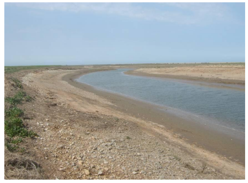
Figure 4. The completed new channel.