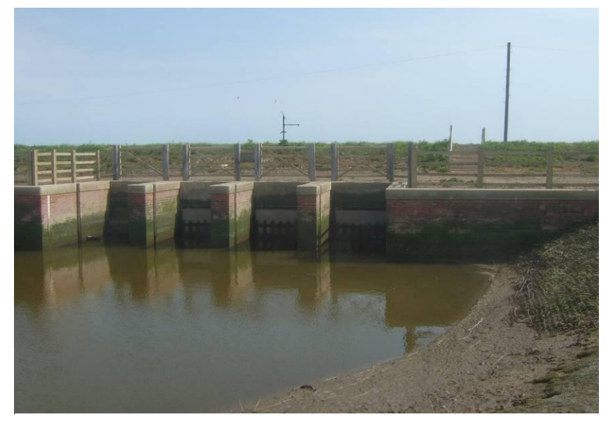
Figure 3. New sluices have been installed to the west of Cley marshes to allow more rapid floodwater evacuation.