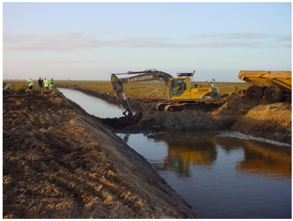
Figure 5. Digger linking the final section of channel.