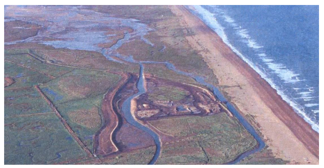
Figure 1. Aerial photo during construction. This shows the old and new route of the River Glaven. The channel at the back (nearest the sea) is the old channel, with the new route on the left further inland. The wetlands are shown in the background.

This scheme on the north Norfolk coast involved a number of different elements and collaborative working. In 2005-2006, the Environment Agency moved the River Glaven 200 metres inland of the existing channel, to reduce the risk of flooding in the villages of Cley and Wiveton (see Figure 1). The old course of the river had a history of being blocked by shingle from Blakeney Point following storms and high tides. Due to the imminent risk the partners came together to protect and enhance the site. The key partners included, the Environment Agency, Norfolk Wildlife Trust (NWT), National Trust (NT) and Natural England (NE).