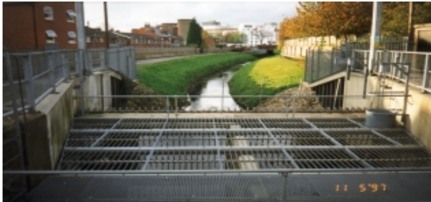
Figure 1.1 View of the canalised river looking directly upstream. The access road is on the left of the river.

The channel and syphon were constructed in the late 1970's as part of the River Leen flood alleviation strategy.