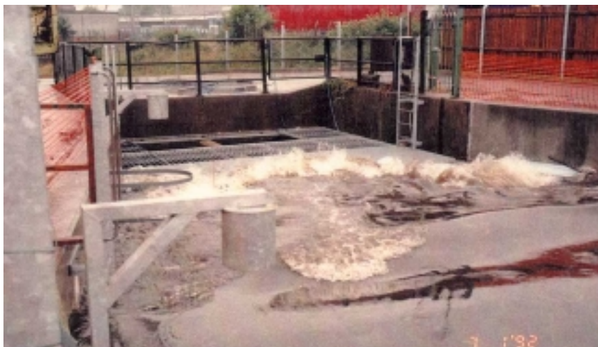
Figure 5.1 Flooding drowned out the installation. Panels in the horizontal platform had to be removed.

During flood events in July and August 1992 serious failings in the original design were brought to light and subsequently a number of modifications had to be made.