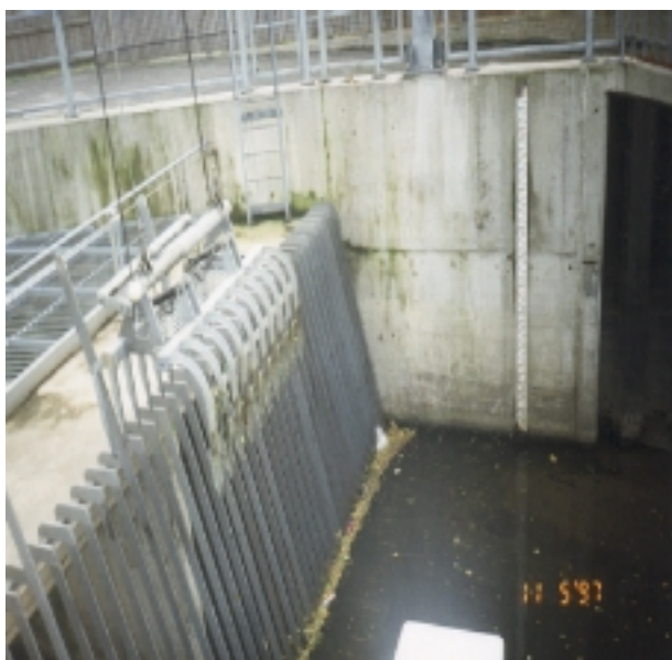
Figure 5.2.1 The mechanical grab has to run on guides that come above the screen area. Originally, these were not in place.

On a number of occasions one of the cables, by which the grab is lowered, has snapped leaving the grab hanging by one cable. When a cable breaks the whole grab and carriage system becomes inoperable. As with heavy loads, this usually occurs over the screen and requires mobilising plant to site such that it can be retrieved and repaired. The operations staff suggest this is down to general wear and tear rather than the removal of a heavy load, although it is more likely to occur as a combination of both.