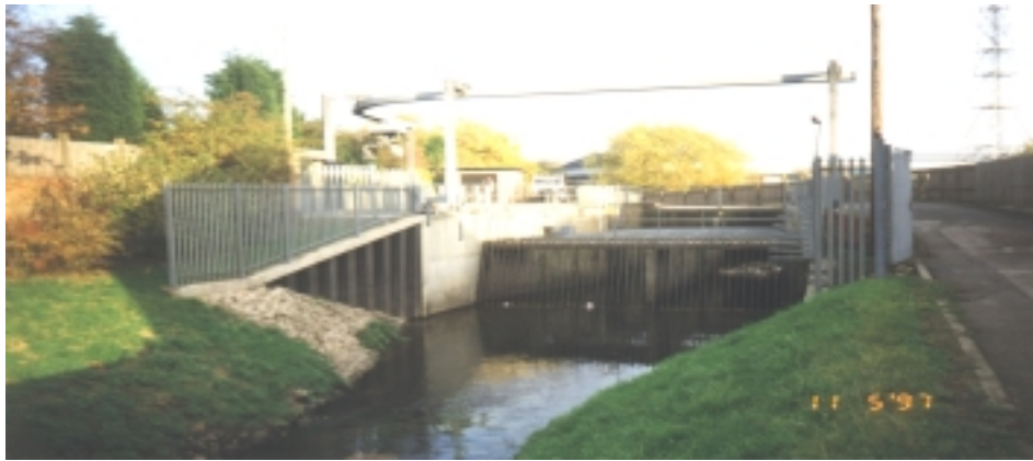
Figure 2.5 View on the screen from the access road, up-stream, note the gantry arrangement. Also note the security fencing to prevent access to the screen compound and moving plant.