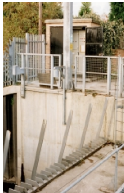
Figure 3.1 The extended guide bars are clearly visible here as is the ultrasonic level gauge near the bottom of the gantry pots.

A telemetry system records the water levels upstream and downstream of the screen and automatically triggers the grab cleaning cycle following a differential reading of 0.5 metres. The grab can also be operated manually from location on site. In the event that the system registers a fault or power failure occurs, the screen has to be cleaned manually. This is a particularly hazardous operation and a careful, assessment of flow conditions are required before operatives venture anywhere near the screen.