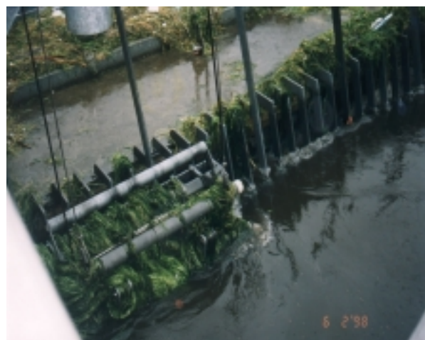
Figure 5.2.2 Grab in operation during high flow.