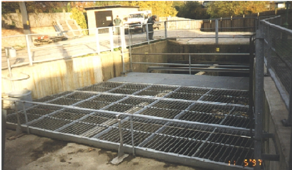
Figure 2.4 View on the horizontal screen area looking downstream. Note that the area at the rear is now open.

To the rear of the screen and across the flume channel there exists a horizontal screened overflow grill and a removable open mesh walkway. The flume channel has been left uncovered to the rear, between the walkway and the entrance to the syphon culverts. This is to ensure the flow of water and small debris during extreme flood conditions which could otherwise lead to complete blockage of the screen and screened overflow, resulting in flooding upstream of the site.