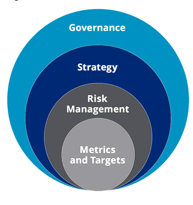
Figure 4: The TCFD recommendations

58. The TCFD recommendations are structured around four thematic areas that represent core elements of how organisations operate: governance, strategy, risk management, and metrics and targets. These might be considered to apply to pension trustees (as asset owners) as follows: