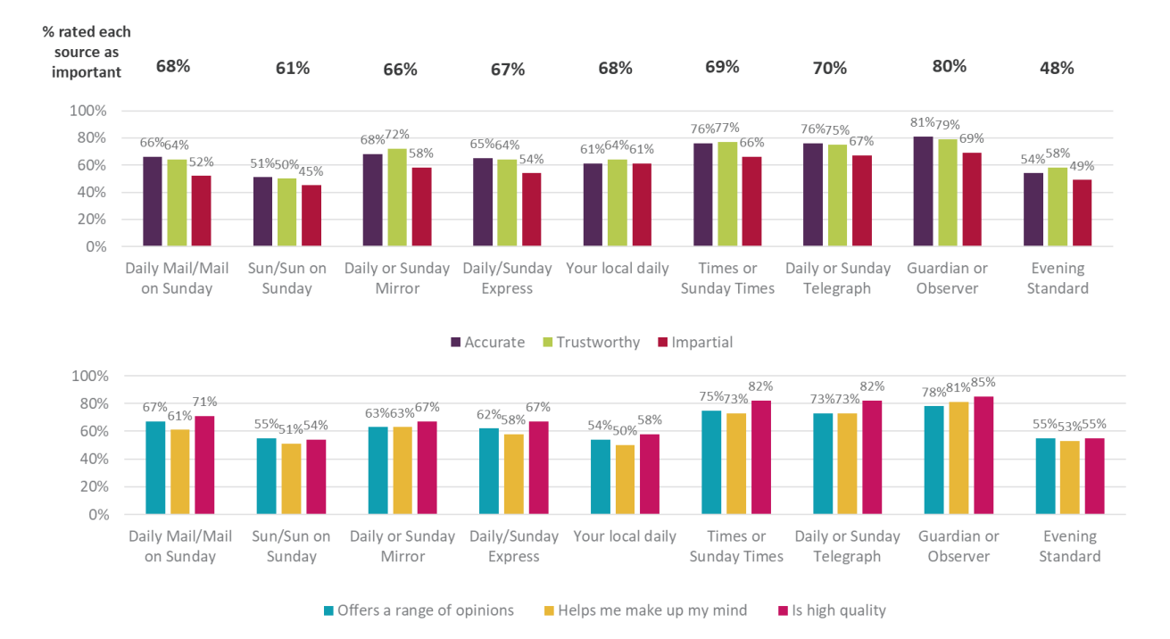
Figure 4: Perceived importance of newspaper sources and views on their attributes among those who use each source weekly or more often, 2019